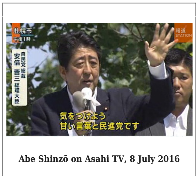
Abe Shinzō on Asahi TV, 8 July 2016

Following the passionate and well-attended protests against the Security Law in 2015, one might have expected greater levels of voter interest in the constitutional issue. However, Abe downplayed constitutional revision during the campaign, framing the election instead as a referendum on Abenomics, his program to revive the Japanese economy. Following Abe through a series of campaign speeches on the street ( gaitō enzetsu ), the Asahi News Network pointedly noted that the prime minister “ did not mention constitutional revision even once ,” instead criticizing the “irresponsibility” of the opposition parties and saying that he was only half-way through with Abenomics.