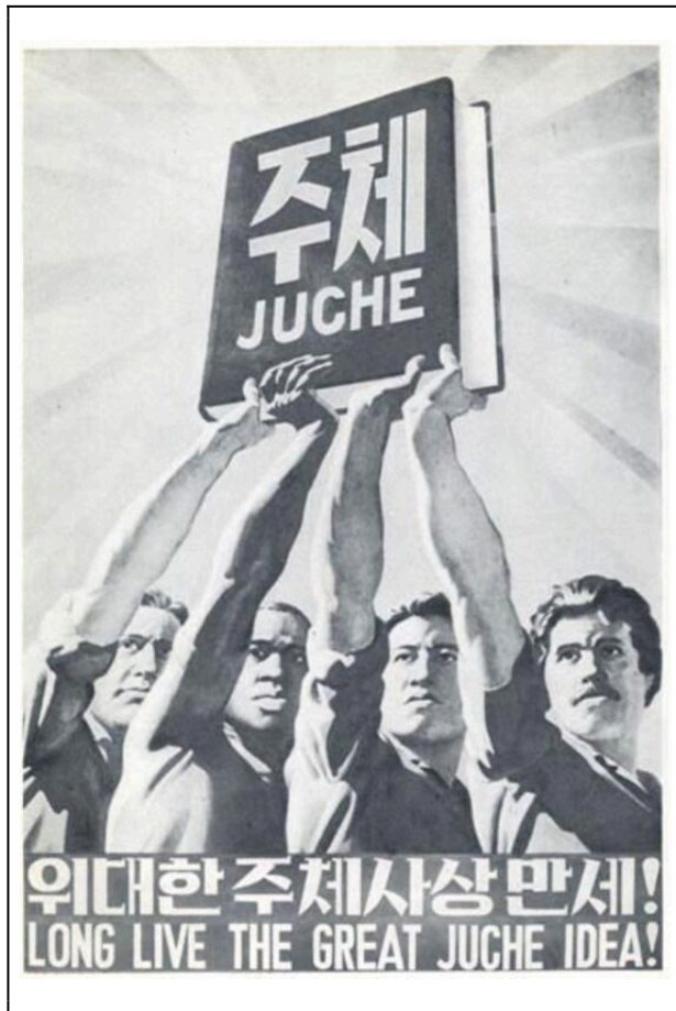
The simple binaries - capitalism/communism, rational/irrational, mature/juvenile, good/evil -

characterize almost all the post-communist reflections of erstwhile communist adherence, whether collectively or individually. The few exceptions, such as Christa Wolf who sought to recuperate the complexity of East German life under communist rule, are rare and castigated to boot. What then of one of the last redoubts of the former Second World of communism, North Korea? To be sure, the North Korean regime doesn't consider itself to be "communist" - in the dominant North Korean discourse, Soviet-style and Chinese communist models have both failed - but rather a democratic republic under the rule of the Labor Party and its ideology of juche (usually translated as "self-reliance"). Be that as it may, there is no doubt that as of 2016 the Labor Party under Kim Jong-un is in power and there isn't much popular reflection or remorse coming from North Korea save for the case of refugees who have fled the country.