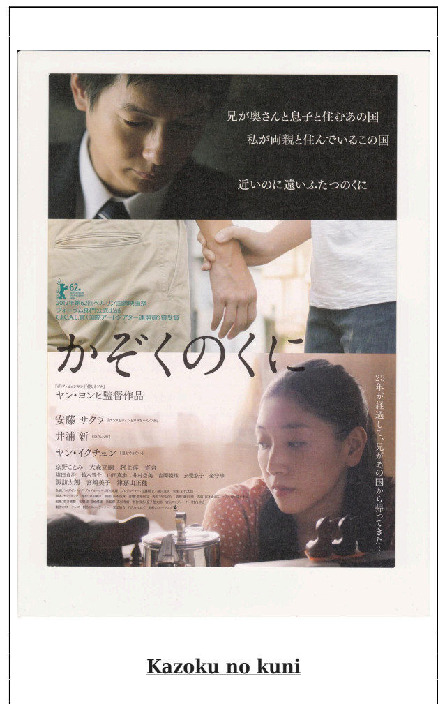
Kazoku no kuni

first-generation Zainichi in Osaka, and her brothers’ decision to emigrate to North Korea, and about Yang’s niece, a young daughter of one of the brothers who had emigrated to North Korea. Both accounts attempt to depict the full dimension of Zainichi and Zainichi-turned-North Korean lives, replete with humor and warmth often lacking in other accounts. Above all, without being blind to the larger context of Zainichi lives, the documentaries depict them as multidimensional human beings.