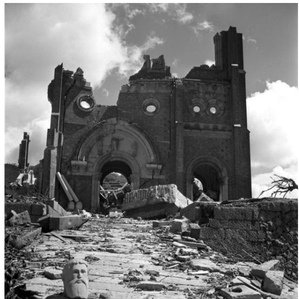
Urakami Cathedral, Nagasaki, damaged by the atomic bomb.