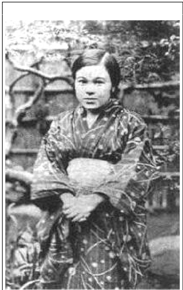
Chiri Yukie (1903-1922). Date of photograph unknown.

Yukie's book contains thirteen songs of gods, such as the owl, fox, rabbit, little wolf, sea, frog, otter, and swamp mussel deities, and the spirit of the damp ground. "Silver Droplets Fall" is the first in her collection, and one of the two owl god songs. The owl (or more precisely, in Horobetsu, Blakiston's eagle owl) is kotan-kor-kamuy , the guardian god of the kotan (hamlet).