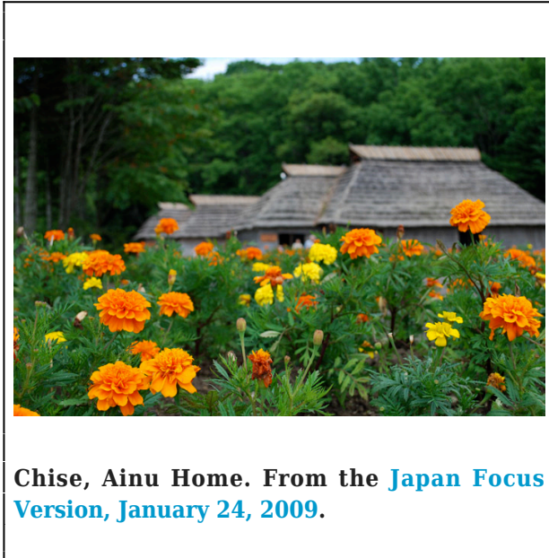
Chise, Ainu Home. From the Japan Focus Version , January 24, 2009.