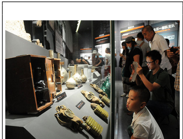
Visitors look at exhibits at the Museum of Evidence of War Crimes by Japanese Army Unit 731, in Harbin, Heilongjiang province, on Aug 15, the day the museum opened to the public.

"And I found out for the first time about the Americans. Why didn't they prosecute them? I felt that was really hard to accept. Definitely, Chinese people will feel that way," she said.