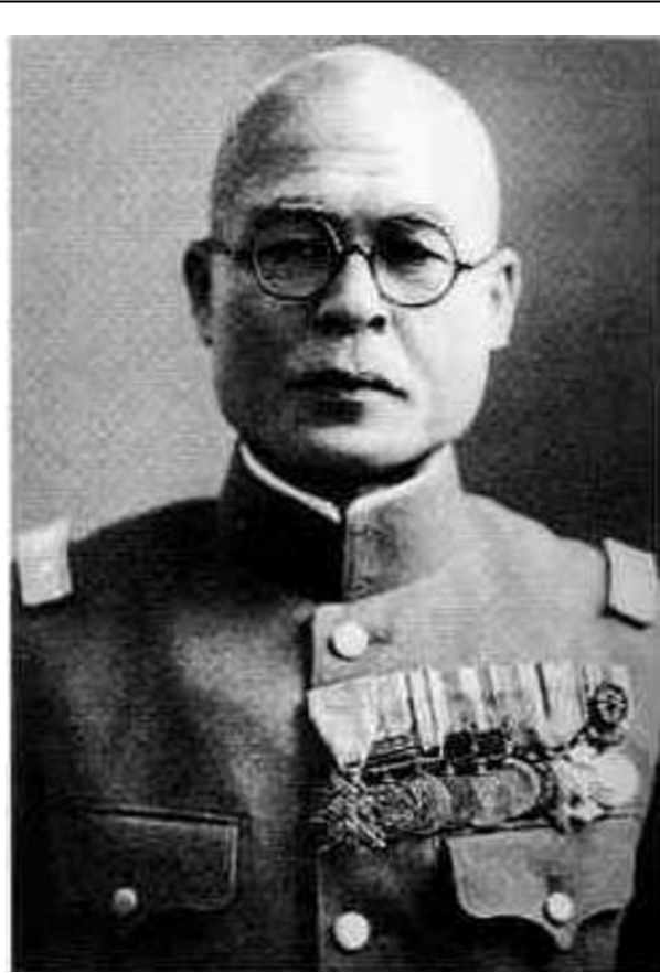
General Yanagawa Heisuke

Lt. General Yanagawa Heisuke [1879-1945] was one of the senior members of the “Imperial Way faction” in the Imperial Army. The domestic aim of these ultra-rightwing nationalists was the complete eradication of the remaining elements of Japanese democracy; the adoption of national socialist economic policies similar to the Nazis; and the restoration of full political power to Emperor Hirohito. As for foreign policy, they fully supported the expansion of the Japanese colonial empire, yet believed the Soviet Union was Japan’s principal enemy due to its promotion of communism. 6