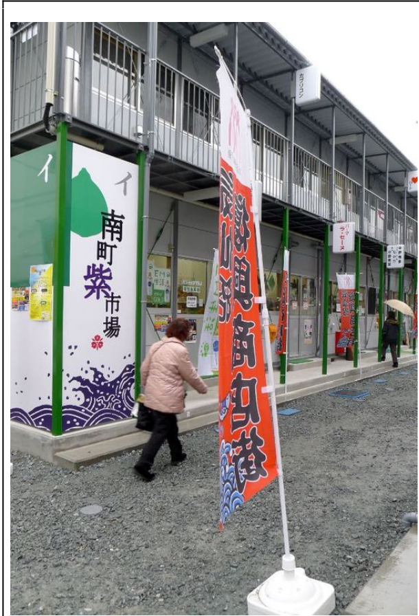
Fig. 2: The prefab Mina-machi Murasaki Ichiba (Violet Market) in Kesenuma, Miyagi Prefecture. 11 March 2012.

The 3/11 daishinsai sparked a lively debate in the Asahi Shinbun and elsewhere about whether the crisis would occasion the spread in Japan of kifubunka , or “a culture of giving.” 8 On its website JACO (Japan Association of Charitable Organizations) lauded the temporary (five-year) post-3/11 tax reforms that allows individuals to either deduct from their income tax or to gain as a tax credit, 80% of their donations, up from the earlier limit of 10%; for incorporated donors, the entire amount of a donation (to registered outfits) is tax deductible. A recent permanent reform, building on progressive legislation passed in 1998 concerning the role of incorporated NGO/NPOs, allows individuals to either deduct from their income tax or to gain as a tax credit,