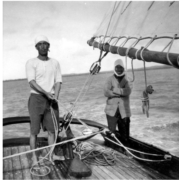
Crew of the Sedney, a pearling lugger operating off Thursday Island, off the coast of the Cape York Peninsula, Far North Queensland, Australia, 1936. The captain and most of the crew were likely from Ukui in Wakayama Prefecture, Japan.

In addition to the locally detained Japanese, civilian internment camps also came to hold Japanese who had been captured by the Dutch in the Dutch East Indies and the British and Free French governments in their colonies across the South Pacific. As the interning power, these governments had residual control over the administration of the civilian internees they had detained. This meant that the interning powers, and not Australia where the Japanese were interned, decided whether or not the internees could be repatriated. 15