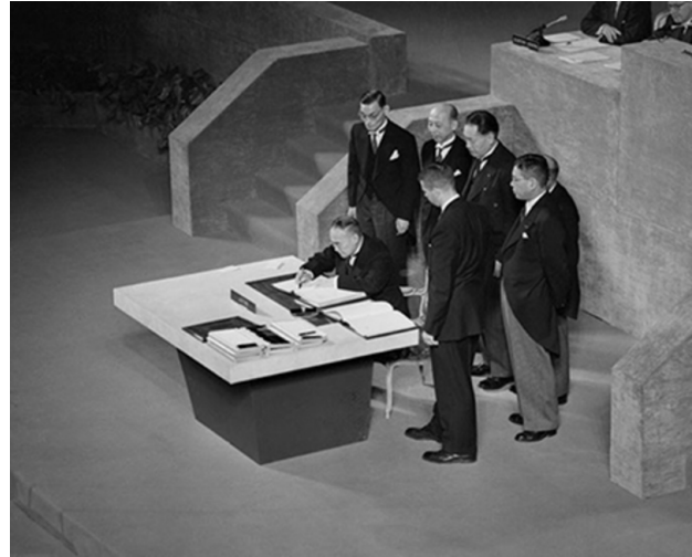
Japanese Prime Minister Yoshida Shigeru signs the San Francisco Peace Treaty on September 8, 1951. 47 other countries also signed the treaty.

It was against this background that the Allied occupation formally and finally came to an end. The Treaty of Peace with Japan, popularly known as the San Francisco Peace Treaty, was signed by Japan and 47 other nations in September 1951, laying out the terms, widely regarded as generous, for Japan to resume sovereignty in 1952. Only a few hours later on the same day, however, Japan signed a second, bilateral security treaty with the United States. This established the terms of a continued military alliance between the two countries, and locked Japan firmly within the orbit of U.S. cold-war strategy.