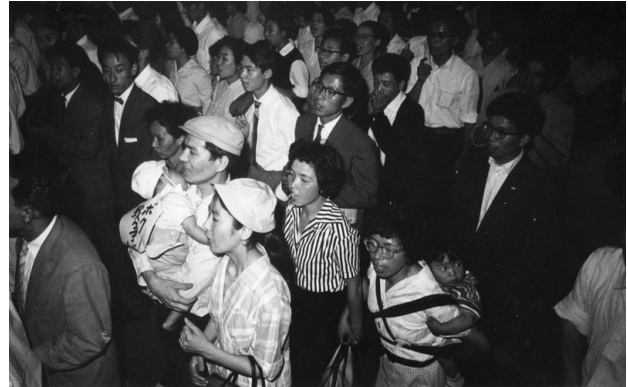
Families with children participate in a rally on June 18. One child has a message attached to him that speaks in the child's voice. Though part of the sign is obscured it probably reads something like "I hate war" ( Boku wa sensō ga iya da ). Many parents were politicized around the security treaty issue through their role as protectors of their children. For the people demonstrating here, the Anpo treaty was taken to be a threat to the safety of their families.

Students are a final group who played a pivotal role in the 1960 Anpo demonstrations. Zengakuren ( Zen Nihon Gakusei Jichikai Sōrengō , or All Japan League of Self-Governing Student Associations) was the most important network of student activists. After forming in 1948 out of a movement to resist U.S. "imperialism" in reforming the university system, it would remain a formidable bastion of anti-American sentiment and left-wing politics throughout the postwar.