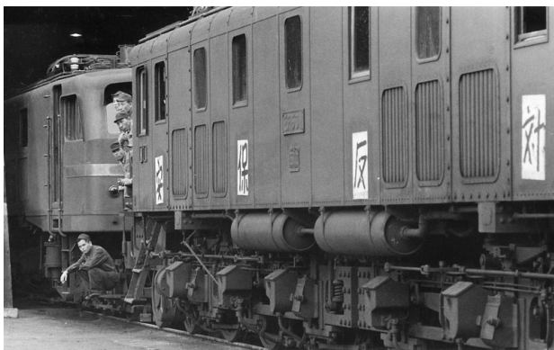
June 22, 1960. Striking rail workers sit on an idle train in a yard in Tokyo. The signs attached to the side of the car read "Against Anpo," one of the most common slogans of

the protest. The general strike on June 22 was the third strike that month. It involved 6.2 million workers and shut down the trunk line running from Tokyo to Osaka for the first time in history.