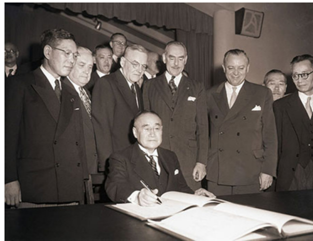
A smaller gathering later the same day, when the separate, bilateral U.S.-Japan security treaty was signed.

The terms of the two treaties reflected ongoing U.S. anxieties about the spread of communism in East Asia. The Treaty of Peace excluded key countries, including some of Japan's most significant neighbors and former enemies. The Soviet Union, Korea, India, and—perhaps most importantly—China were not signatories. Both the Soviet Union and India refused to sign