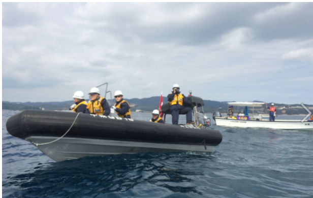
Japanese Coast Guard monitoring media at Henoko

According to Nago City's US Base Affairs Section, between last November and February 4, 12 demonstrators were injured in confrontations with the police and Coast Guard - 5 of which were taken to hospital by ambulance. Injuries verified by Nago City include a man whose rib was broken when he was shoved in the chest by a member of the Coast Guard on January 16 and a 49 year-old man injured by the riot police on January 23 who was left with injuries to his hand requiring a month to recover.