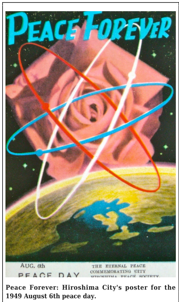
Peace Forever: Hiroshima City's poster for the 1949 August 6th peace day.