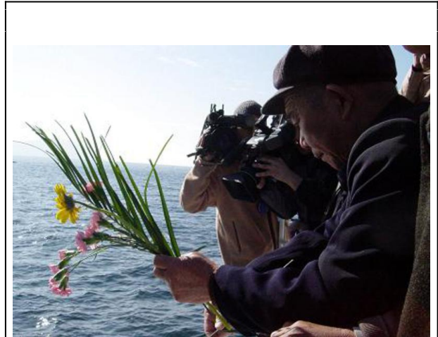
A Chinese survivor of forced labor at Mitsubishi’s Hashima coal mine tosses flowers into Nagasaki Bay in 2004, during a shipboard memorial ceremony for fellow Chinese workers who died at the site that Japan wants to see recognized as a world cultural landmark. The prefectural government rejected the mourners’ request to hold the service on Hashima Island.

views are now retreating. In no other country in the world does the Second World War remain an ongoing issue and disputes over the war are yet to be resolved.