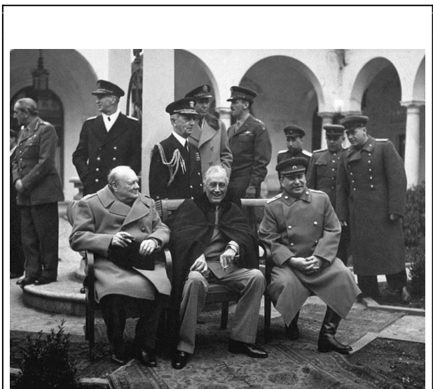
Churchill, Roosevelt and Stalin at Yalta, Feb. 1945

US-UK-USSR Yalta Conference of February 1945, where Roosevelt and Churchill recognized Soviet territorial expansion in Eastern Europe as well as in its Far East. The “Agreement Regarding Entry of the Soviet Union Into the War Against Japan” signed by Stalin, Roosevelt, and Churchill in February 1945—the so-called Yalta Protocol—is an important agreement providing a core blueprint for the post-war international order in the Asia-Pacific. It outlined the conditions under which the Soviet Union would enter the war against Japan. In addition to the cession of territories (Southern Sakhalin and the Kurile Islands) from Japan to the USSR, it included agreements concerning China, such as the preservation of the status quo in Outer Mongolia 2 (1), the lease of Port Arthur as a naval base, the internationalization of Dairen with Soviet preeminent status (2-b), and joint Soviet-Chinese operation of the Chinese Eastern and South Manchurian railways (2-c) (US State Department 1945, p. 984).