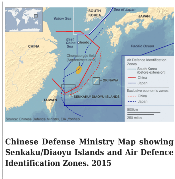
Chinese Defence Ministry Map showing Senkaku/Diaoyu Islands and Air Defence Identification Zones. 2015

This article looks at how the territorial disposition of Okinawa, Taiwan, and the Senkaku/Diaoyu Islands were dealt with in the process of constructing the post-war international order in East Asia and how the territorial disputes between Japan and China emerged, developed, and remained in the regional Cold War system, with particular attention paid to the relations between Japan, China, and the United States. In doing so, it attempts to provide a broader international context beyond the China-Japan bilateral framework to consider possible solutions.