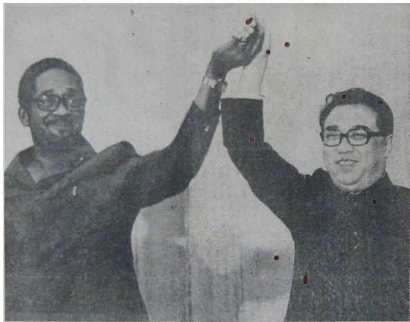
Forbes Burnham and Kim Il-Sung in Pyongyang, late 1970s

In addition to the pragmatic need for aid and diplomatic support, other factors drew the PNC to North Korea. In the prevailing atmosphere of Third Worldism, and the Black Power movement rocking the Caribbean of the 1970s, Soviet socialism had limited credibility; at the same time, Maoism was not useful to a thoroughly urban-based ruling party encircled by a hostile countryside. By contrast, Juche seemed to perfectly reinforce the Burnham brand, notably his obsession with self-reliance, his emotionally-tuned nationalism and his faith in the power of education and culture to transform concrete reality. North Korea's self-identification as a member of the Third World, and Kim Il Sung's emphasis on anti-imperialism and the attention he paid to issues facing post-colonial states had a special appeal to the left-wing of the PNC, as it did to other Third World radicals. By the 1970s North Korea had recovered from the devastation of the Korean War, underwent rapid industrialization and developed a seemingly robust economy; to the scores of Latin American and Caribbean activists, intellectuals and artists who made the pilgrimage, the grandeur of Pyongyang seemed to offer proof that the so-called Third World could in fact achieve rapid development through a socialist path. 17