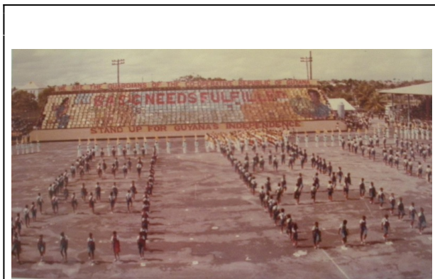
Guyanese Mass Games, 1986

The content of Mass Games in Guyana reflected a distinctly Guyanese appropriation of the North Korean medium. The portrait of Forbes