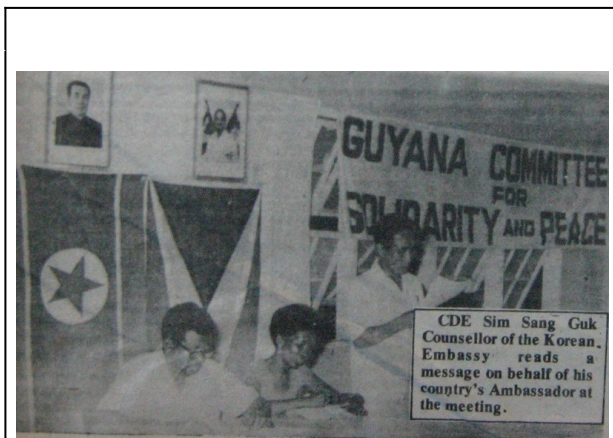
The Guyana Committee for Solidarity and Peace hosts an event for "Month of Solidarity with the DPRK," June 1980, at the Guyana Mines Workers Union hall in Linden. Left to right: Committee