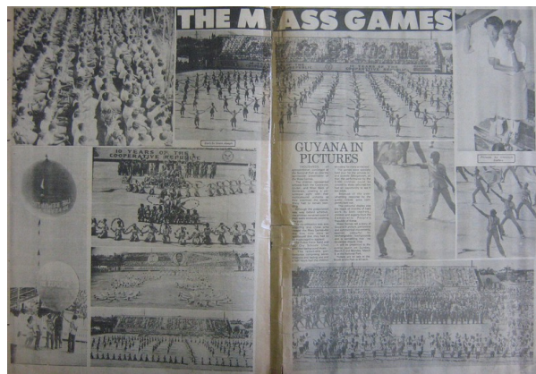
State media coverage of the first Guyanese Mass Games in 1980