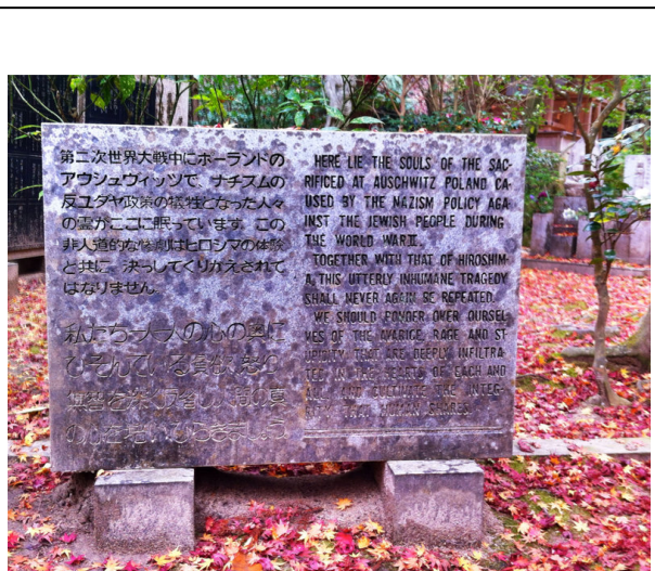
The Hiroshima Auschwitz Memorial in Hiroshima where the Auschwitz remains