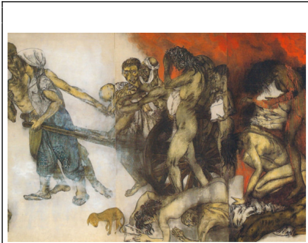
From Maruki Iri and Maruki Toshi, Hiroshima Panels

psychology that makes war possible... [and] will lead humankind to destruction." 50