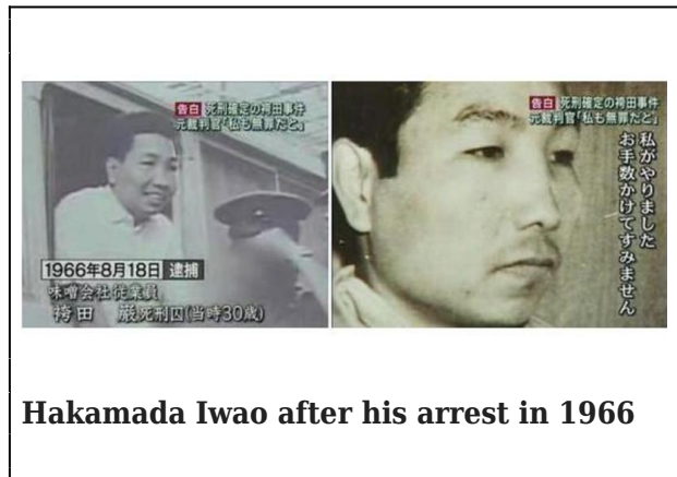
Hakamada Iwao after his arrest in 1966