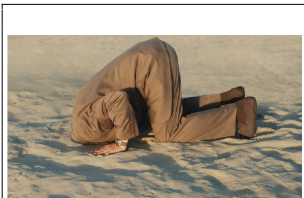
Japanese prosecutor explaining why his office appealed the decision to grant Hakamada a retrial

legal professionals are merely scratching the surface of these critical questions. Wrongful convictions are hardly a thing of the past in Japanese law and society, in part because unfair criminal trials and procedures have not had the "educative effect" that Chalmers Johnson (1972) predicted when he finished his case study of the "Conspiracy at Matsukawa" more than forty years ago. For the problem of wrongful convictions to persist in the decades to come, all Japan needs to do is continue denying this reality.