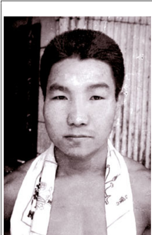
Hakamada Iwao before his arrest in 1966

some lessons that should be learned from this troubling and telling case study. Foremost among them is the need to reduce the level of denial about the possibility of wrongful convictions in Japanese criminal justice.