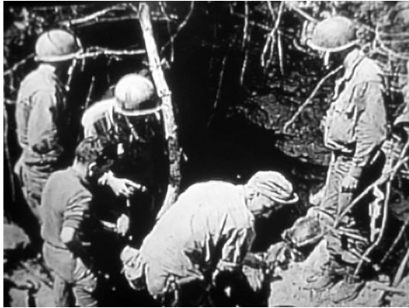
American soldiers at the mouth of an evacuation cave