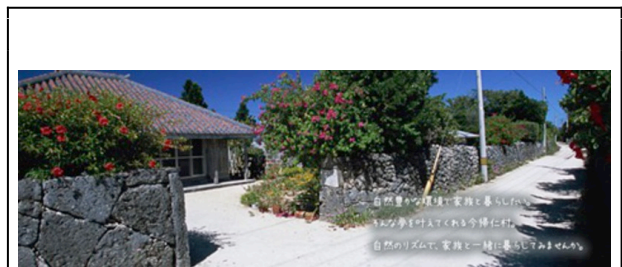
Traditional home in Nakijin Village

On arriving in Nakijin, we discovered that the houses in our little Imadomari neighborhood had been destroyed. We were told that when the Americans had found Japanese soldiers hiding in one house, all of the small, thatched-roof houses had been burned. Now my father and other men set about constructing shacks for shelter. Ours was right at the seashore and consisted of one tiny room where we lived and slept. My father was a fisherman, but fishing, as well as going out in boats, was prohibited, so we had almost nothing to eat. Farm families had sweet potatoes and some vegetables, but we resorted to collecting seaweed or wild greens by the roadside. Even the seaweed was "trash" seaweed that had washed up on the beach. At times we received limited food rations from the Americans, and my mother used such things as flour or small amounts of corned beef hash to make soup or dumplings.