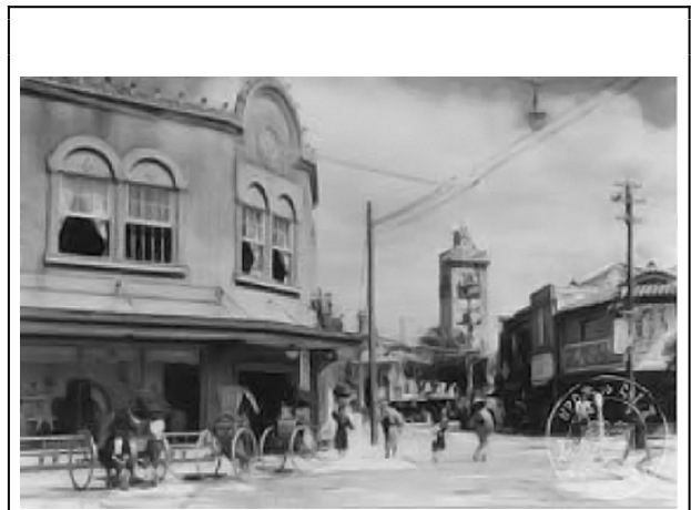
Naha before World War II