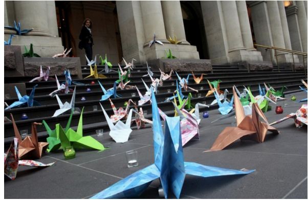
Figure 1: Flock of origami cranes at vigil for Fukushima, March 2011, Melbourne. 19

The "3/11" compound disaster also galvanised expatriate Japanese communities and their supporters. As soon as the terrible news of the disaster came through, vigils were held in capital cities and regional centres across Australia. In Melbourne, for example, a vigil was held in the city centre on the evening of 17 March 2011, on the steps of the former General Post Office Building. The steps were decorated with a flock of giant origami cranes and rows of candles. Every March since then, commemorative events have been held on each anniversary. Given the close connections between the issue of nuclear irradiation at Fukushima and at Hiroshima and Nagasaki, Fukushima is remembered once again every August on Hiroshima Day and Nagasaki Day. There is now an annual rhythm of events in March and August. At each event the connections between these historical events have been explored in more detail and with more subtlety. By an iterative effect, Hiroshima and Nagasaki are constantly being re-remembered, but now through the prism of Fukushima. The organisations that hold these events have built up a repertoire of symbols and practices which carry over from event to event and from year to year, as we shall see below.