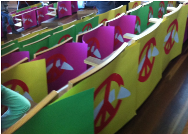
Figure 7: Japanese for Peace Logo. 32