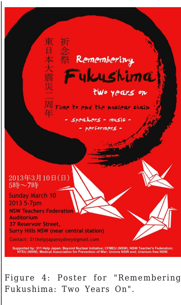
Figure 4: Poster for "Remembering Fukushima: Two Years On".