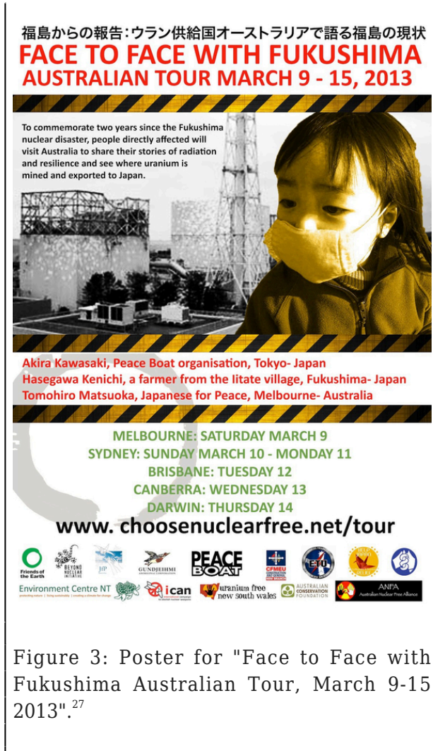
Figure 3: Poster for "Face to Face with Fukushima Australian Tour, March 9-15 2013". 27

preparation for the event, organisers and supporters had also folded chains of origami cranes in remembrance. Origami has become an important element of commemoration at Fukushima-related events. It is well-known that cranes are linked with the story of Sasaki Sadako, a girl from Hiroshima who died of leukemia in the 1950s. As an infant, she had been only a kilometre away from ground zero when the bomb was dropped on Hiroshima. In her final stay in hospital she tried to fold one thousand paper cranes, as there is a legend that wishes will be granted to someone who does this. She died, however, before completing the one thousand, and the remainder were completed by her family. 28 Origami cranes have now become an international symbol of peace, memorialisation and the anti-nuclear cause. 29 When people come together to fold origami cranes, string them together, and then present them as a tribute, this is an embodied practice which expresses solidarity.