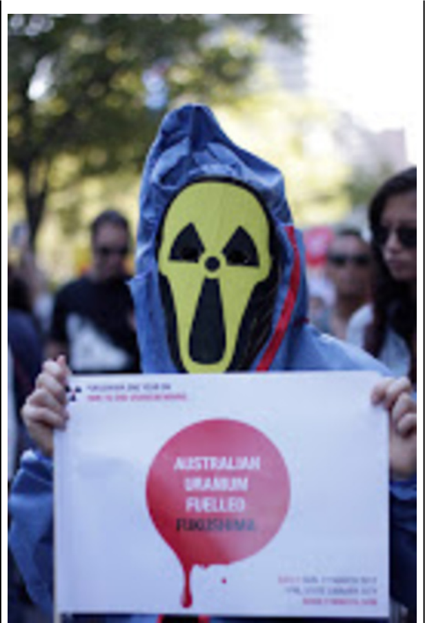
Figure 2: Photograph of Demonstrator at Commemorative Event in Melbourne, March 2012. 21

Children milled about, offering masks to the assembled crowd. The masks were yellow and black, a hybrid image combining the international sign denoting nuclear radiation and a face that mimicked Edvard Munch's (1863-1944) painting of 1893, "The Scream". 20 Variations on this black-and-yellow sign for radiation also featured in demonstrations in other parts of the world. These graphic symbols were originally designed to warn of the danger of radioactivity in a way that transcended particular languages. In their adaptations, the new versions of the symbol have helped to forge a visual vocabulary of transnational activism. One demonstrator was dressed as a giant sunflower, the symbol of solar power - an alternative to nuclear energy and fossil fuels. Some children were dressed in red "oni" (devil) costumes symbolising the evil of nuclear power. A few carried origami cranes.