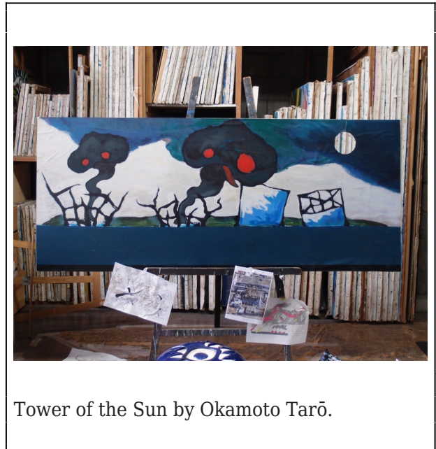
Tower of the Sun by Okamoto Tarō.

logic of the pavilion which he saw represented in the soaring roof of the pavilion. His Tower of the Sun proposed an alternative vision of "life" as the primitive energy of humanity which is neither progressive nor harmonious. 43