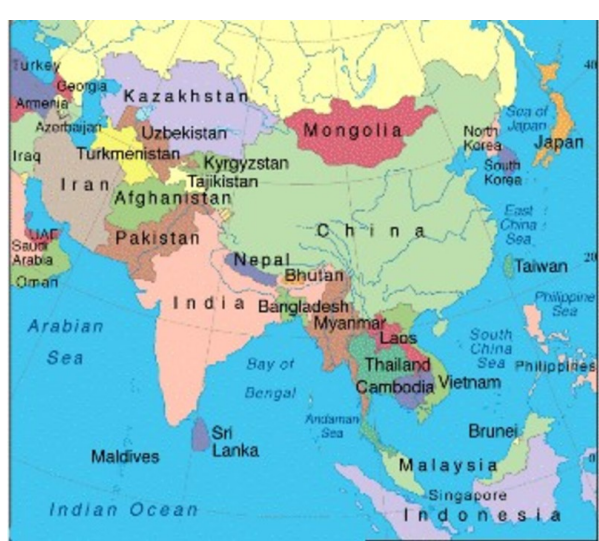
Map of Asia-Pacific Region UK Trade & Investment Asia Task Force