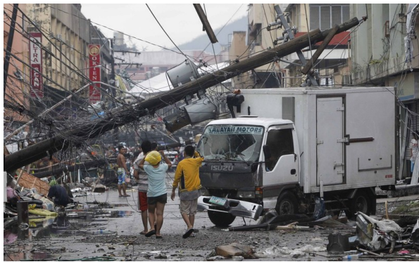
Yes, Typhoon Haiyan Was Caused by Climate Change (The Nation and Foreign Policy In Focus) Ground Zero of Climate Change

In the face of a slow-down in global and regional economies, it will take the country many years of hard work before it recovers its bearing. As a nation of 7,100 islands, the Philippines sits on the front line of global climate change. This tragically means typhoon Haiyan is not the last of nature's bites that Filipinos will have to endure. As climate change begins to impose dire costs, more such disasters loom ever larger on the horizon. The Philippines has already borne the brunt of worsening climate change in economic losses of $1.6 billion per year--from increasingly frequent and intense typhoons.