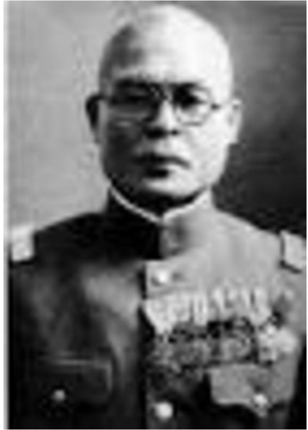
Prince Asaka General Yanagawa