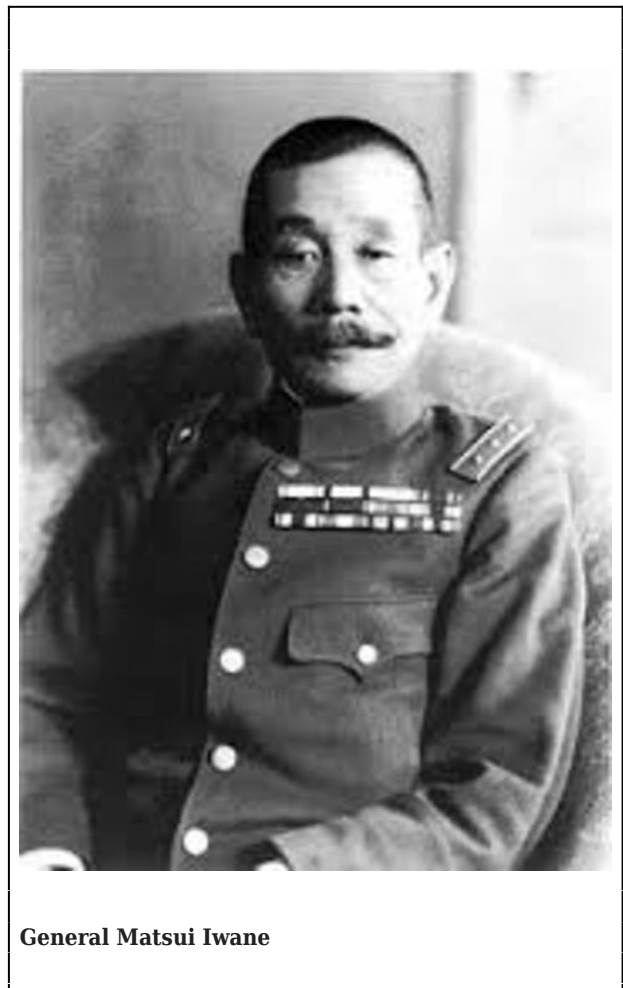
General Matsui Iwane

Conference of 1932-37 as an army plenipotentiary. Although Matsui retired from active duty in 1935, he was called back into service in August 1937 at the start of the Second Sino-Japanese War to lead the Japanese forces engaged in the Battle of Shanghai. Following Shanghai’s fall, Matsui was appointed commander of the Central China Area Army, and it was troops under his command who committed the infamous Rape of Nanjing, beginning in December 1937. Matsui once again retired from active military service in 1938. Nevertheless, the Tokyo War Crimes Tribunal found him responsible for his troops’ earlier brutality at Nanjing and sentenced him to death.