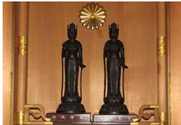
Setagaya Tokkō Kannon-dō Two Setagaya Kannon statues