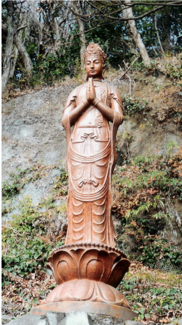
Kōa Kannon statue