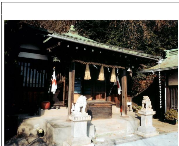
Kōa Kannon temple

Matsui reestablished his relationship with Buddhism as early as 1939. This is evidenced by the fact that he personally ordered the construction of a small Buddhist temple on the hillside behind his summer villa on the outskirts of the seaside, hot-springs resort city of Atami in Shizuoka Prefecture.