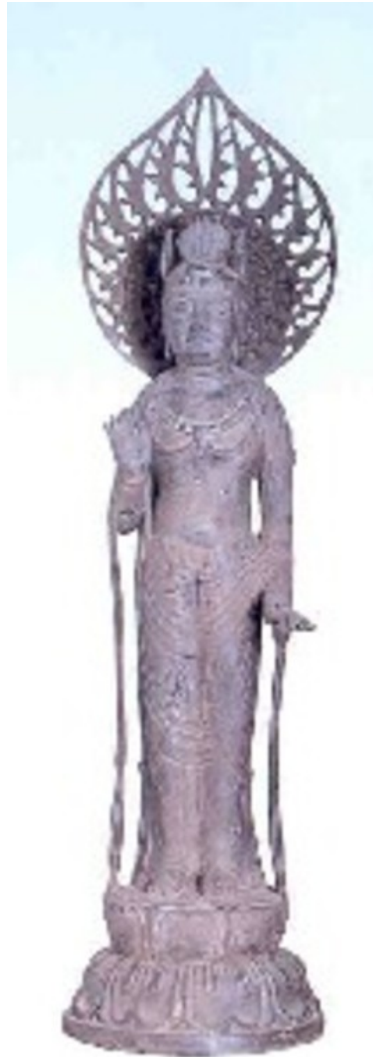
Chiran Kannon temple Chiran Kannon statue