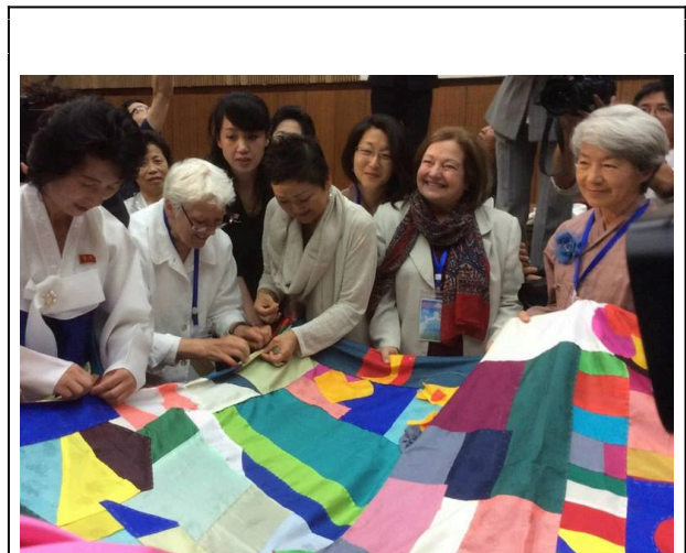
Stitching ceremony that spontaneously emerged during the Pyongyang Peace Symposium (May 21, 2015)

spontaneously at the end of the morning session. We had asked our North Korean hosts to prepare a chogakpo (traditional Korean-style cloth made up of smaller pieces) to be sewn together with two other pieces we would bring - one made in the South and a third made by international women. At the end of the morning session, a representative of the Korean Democratic Women's Union brought out the piece that they had prepared, and one by one, women began to stand up from their seats and the solemn space of the conference room turned into an impromptu place - unrehearsed, unplanned, and spur-of-the-moment, where women improvised to begin to stitch the North Korean cloth to the other pieces, symbolic of our commitment and responsibility to heal the wounds of war and reunite families. And despite our male host telling us that it wouldn't be appropriate to sing, all the women broke out in song, singing "Our Wish is Reunification" ( Uri ūi sowŏn ūn t'ongil ), shedding tears this time of empathy rather than bitterness.