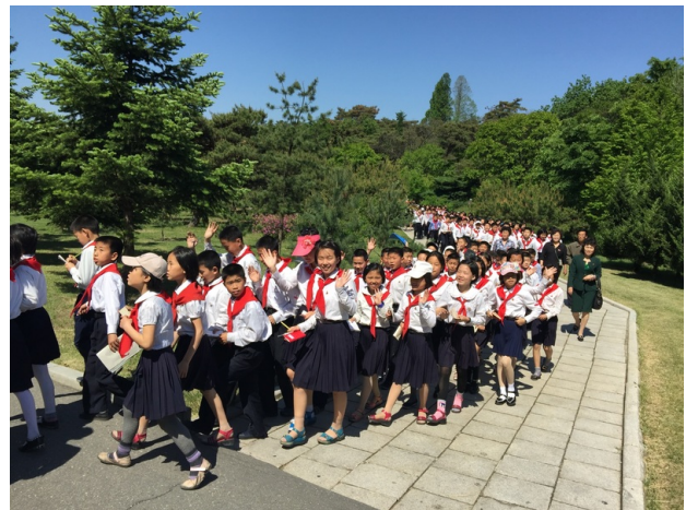
Mangyongdae, the birthplace of North Korean founding leader, Kim Il Sung North Korean school children in school uniform visiting Mangyongdae (May 20, 2015)