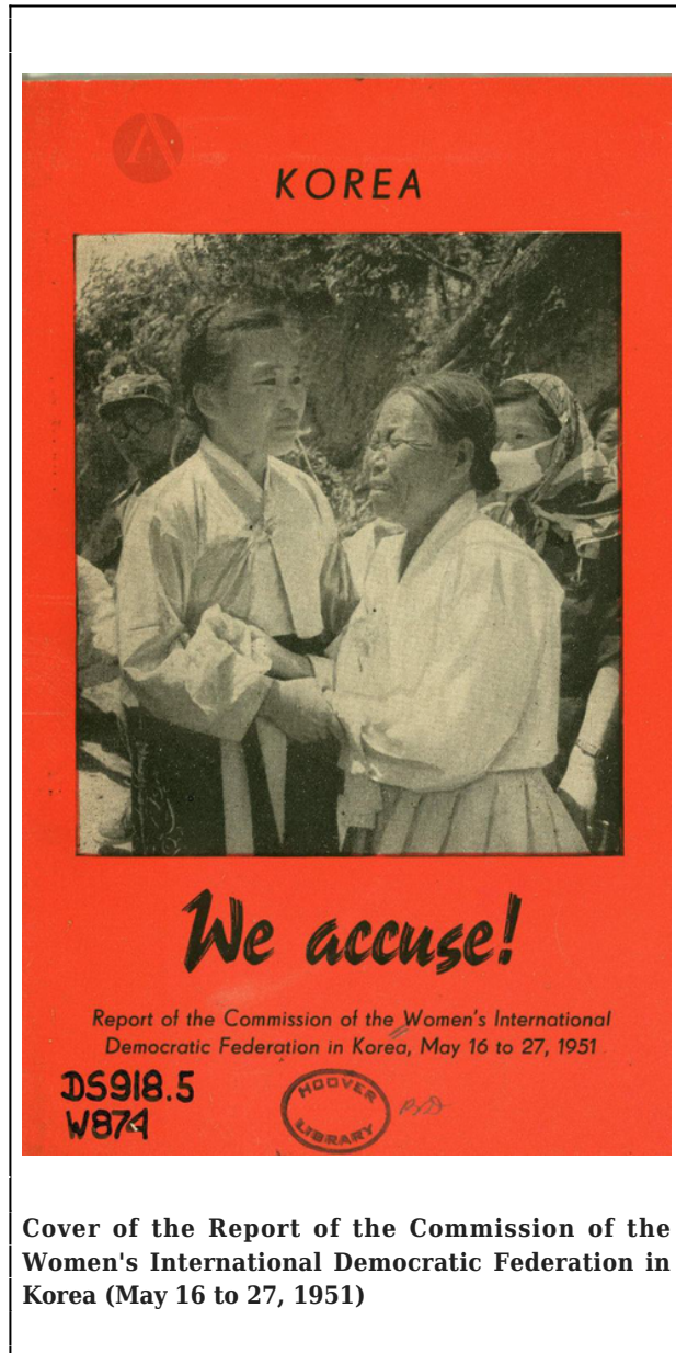
Cover of the Report of the Commission of the Women's International Democratic Federation in Korea (May 16 to 27, 1951)

Korean population ... tortured, beaten to death, burned and buried alive." 27