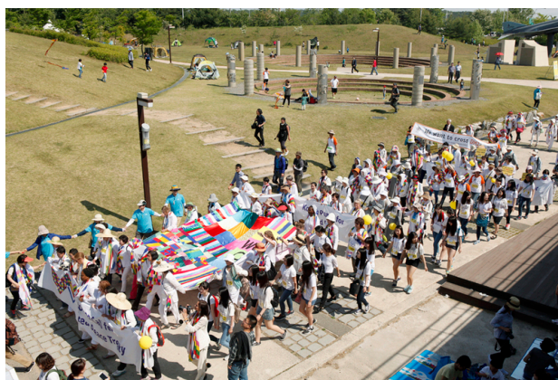
North Korean women waiting to join the Peace Walk in Pyongyang (May 23, 2015) South Korean families joining the Peace Walk in Paju (May 24, 2015)