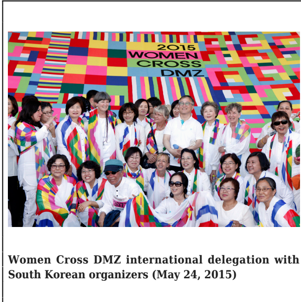
Women Cross DMZ international delegation with South Korean organizers (May 24, 2015)

On May 24, 2015, thirty women peacemakers from fifteen nations, including American feminist activist Gloria Steinem and two Nobel Peace laureates, Mairead Maguire from Northern Ireland and Leymah Gbowee from Liberia, walked with Korean women of the North and South to call for an end to the Korean War and the peaceful reunification of Korea on the seventieth anniversary of its division. The arbitrary division of the peninsula in 1945 by the United States and the Soviet Union led to the creation of two separate states, setting the stage for an all-out civil war in 1950 that became an international conflict. After nearly 4 million people were killed, mostly Korean civilians, fighting was halted when North Korea, China, and the United States representing the UN Command signed a ceasefire agreement in 1953, which called for a political conference within three months to reach a peace settlement. Over 60 years later, we are still waiting. To renew the call for a peace settlement by offering a model of