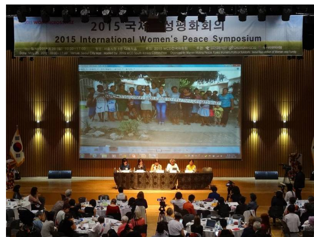
Pyeongyang Peace Symposium afternoon session (May 21, 2015)