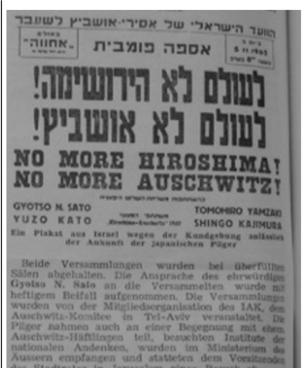
Poster for an assembly against nuclear war and genocide in Tel Aviv, 1962, attended by a Hiroshima Peace Delegation.

As I demonstrated in greater detail in my manuscript Hiroshima: the Origins of Global Memory Culture , perhaps the most prominent of these developments was the emergence of the idea of the survivor and a culture of testimony that drew on disparate sources, both within and outside the Cold War West. 6 In both communities (and, indeed, many others from Beijing to Vienna) the story told after the war was of a journey from darkness into light, of the nation emerging from the crucible of defeat and victimization to achieve resurrection and national strength. Whether it was the founding of Israel or the reemergence of Japan as a pacifist nation, the recent tragic past was immediately conscripted in service of the present. This journey from victimhood to resurrection was inscribed, literally in stone, in both Hiroshima’s and Jerusalem’s main monuments. 7