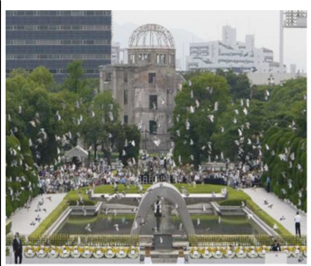
The August 6 Ceremony, Hiroshima. Notice the Axis leading from the Dome through the Cenotaph and into the place of the photographer (on top of the museum building).