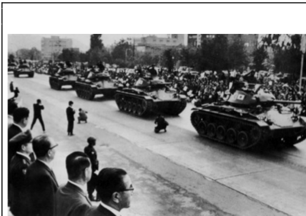
The Japanese Defense Forces’ 13 th Division tanks parading down Peace Boulevard, Hiroshima 1965

With the Vietnam War and the new peace movement, another generation challenged this view of Japanese as victims. This is demonstrated by the work of the novelist and activist Oda Makoto. Oda was the leader of Beheiren ( Betonamu ni heiwa o shimin rengo — Citizen’s League for Peace in Vietnam) and was one of the first major public figures to confront the fallacy of Japanese victim consciousness and to insist that it blinded the Japanese to their own responsibility for past (and present) crimes of war. The Vietnam War revealed Japan’s complicity in contemporary aggression on the continent. Beheiren and other student and citizen groups vehemently opposed blanketing these historical and political realities under the usual abstractions. Oda and other activists directly challenged Japan’s victim narrative. When the ruling LDP endorsed anti-nuclearism with the three non-nuclear principles (while covertly colluding with America over breaking these very principles) and for the first time sent Prime Minister Sato Eisaku to Hiroshima, the students stormed the ceremony and fought a pitched battle with the Hiroshima police.