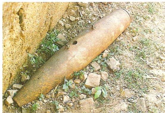
In 1988, farmers at Phnom Chisor pointed to an unexploded U.S. bomb still lying where it had fallen in 1973.

This is a valuable insight into the nature of the database and the thoughtful analysis that High, Curran and Robinson have conducted. But it is simply a window into the process. We do not have access to the details of the process that they used to build their database, nor to the complete database on which they have made these final calculations. Without further information we do not know, for instance, why a zero erroneously added to each bombing load weight could have produced an approximately fivefold tonnage over-estimate (from c. 0.5 to 2.7 million tons), rather than a tenfold error. But we do have here a glimpse into some of the process of the data analysis that it would be valuable to have fully entered into the public record. This would allow us to compare the database they built with the one we used for our analysis, which to the best of our knowledge are similar in structure. To get this important historical analysis right, we ask High and her colleagues to release their database and more fully explain the process by which they created it from the Pentagon’s original files.