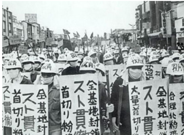
Protest against US base, before Kadena Air Base, March 1971.

On mainland Japan - as on Okinawa - the majority of people were against the war. Surveys revealed overwhelming opposition to the conflict and, in the late 1960s, millions of mainlanders participated in demonstrations to express their anger at the war. Beheiren (Japan Peace for Vietnam Committee), the umbrella movement of loosely-affiliated anti-war groups, included such well-known luminaries as artist Okamoto Taro and novelist Oe Kenzaburo, who today remains active in the anti-nuclear movement. 13