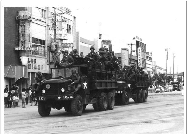
Koza, Okinawa, 1970.

During the Vietnam War, Okinawa's economic situation was bleak so many residents appreciated base jobs, which were relatively stable and well-paid. Yet for many Okinawans, such labour was accompanied by a sense of complicity in the deaths of hundreds of thousands of Southeast Asians. This distress was magnified by memories of the spring 1945 Battle of Okinawa in which almost one third of the island's civilian population had been slaughtered.