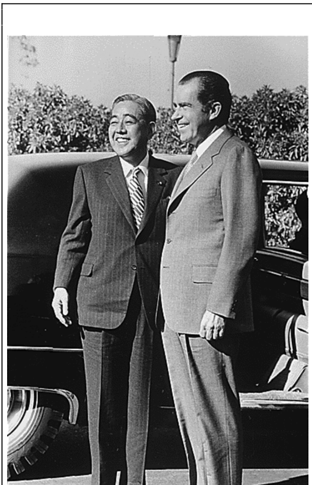
Richard Nixon and Sato Eisaku, 1972.