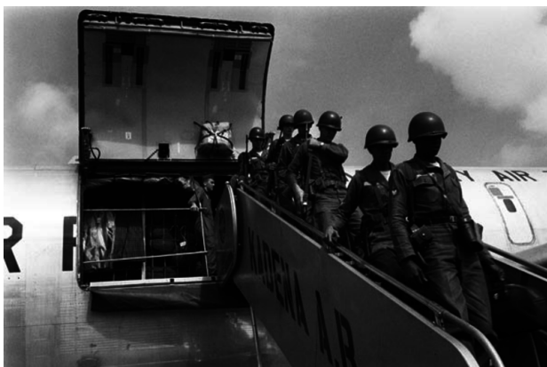
Kadena Air Base, early 1960s. US soldiers en route to Vietnam arriving from Hawaii at Kadena, February 1962.

Kadena Air Base served as the Pentagon's key transport hub. During the war, it racked up one