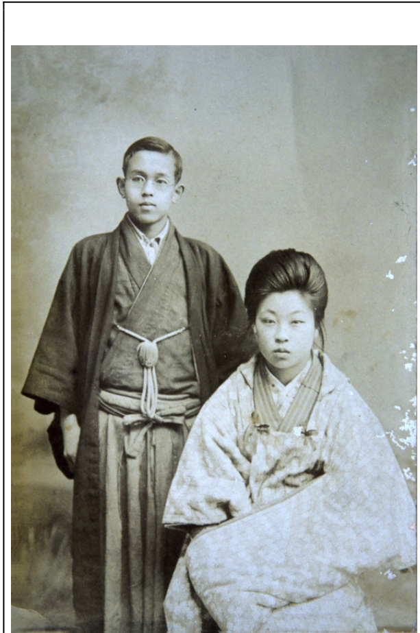
Ishikawa Takuboku and Horiai Setsuko after their engagement in 1904.

The society of Ishikawa Takuboku's era was in dramatic political flux, and its complex issues became his personal obsessions. After his death, Takuboku's preoccupations came to be seen as a symbol of the social and emotional upheavals of his times.