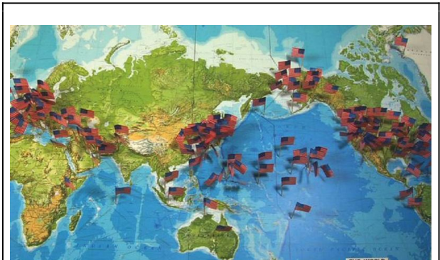
The empire of bases. A graphic from Living Along the Fenceline.

Two recent documentaries make excellent viewing for anyone interested in the history of American military bases overseas - and their ongoing ramifications. With an estimated 1,000 US military bases outside of the 50 states, the United States currently has the largest number of overseas military bases of any country in history. Why does the US need military bases in over 130 countries? Why do countries like Germany, Italy, Japan and South Korea still host hundreds of American military bases and thousands or tens of thousands of US soldiers, more than six decades after World War II? Why is the US still aggressively expanding into many new countries? Standing Army (72 min., 2010) is a far-reaching exploration of the ideological and geo-political answers to these questions. Living Along the Fenceline (67 min., 2011), though also international in scope, is a more narrowly focused film, answering a critical question: How do these bases affect local populations? Offering both global and personal perspectives, these two films are complementary and would work well together as tools to initiate dialogue and discussion on base issues and the role of American global military power.