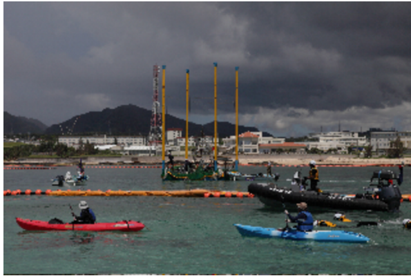
Henoko: Drilling Survey and Protesters, Camp Schwab in Background, September 2014.