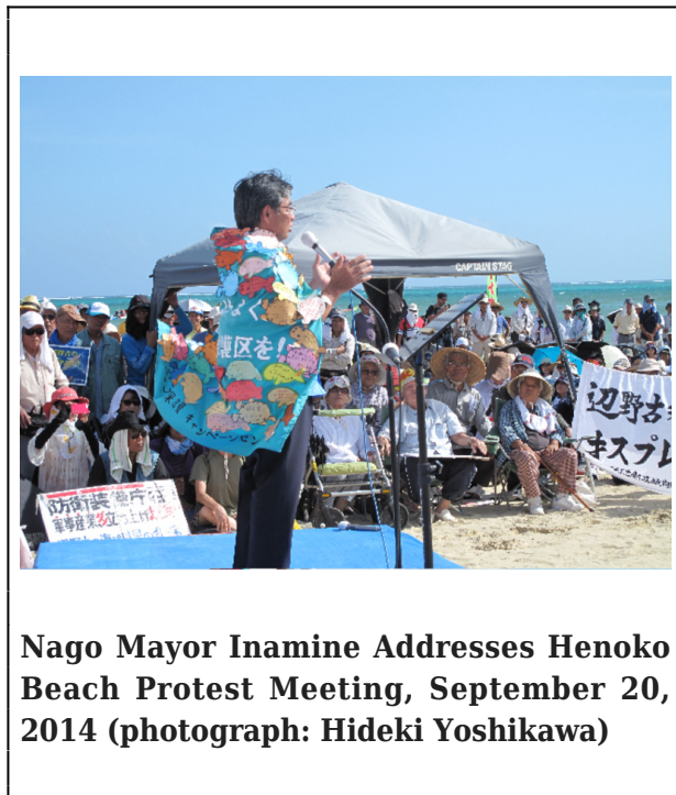
Nago Mayor Inamine Addresses Henoko Beach Protest Meeting, September 20, 2014

4) Pending satisfactory resolution of the above three matters, the Government of the United States should call upon the Government of Japan to suspend base construction works at Henoko.