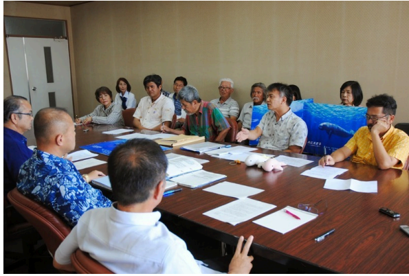
Fact finding meeting between NGOs and Okinawa Prefectural Government, June 6, 2014 (author with arm raised, speaking)