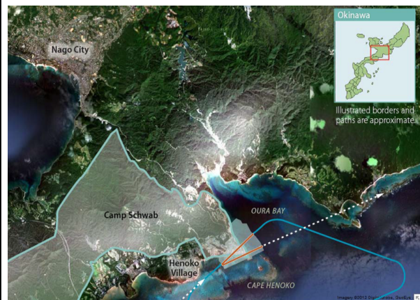
Location of Proposed Futenma Replacement Facility at Henoko, Nago City

In May 2006, the “U.S.-Japan Roadmap for Realignment Implementation” spelled out the second Henoko plan (the design still current). 6 It called for the construction of a base featuring two 1,800 meter-runways in a V-shape, extending from the existing U.S. Marine Corps facility at Camp Schwab into Oura Bay to the West and Henoko Bay to the East.