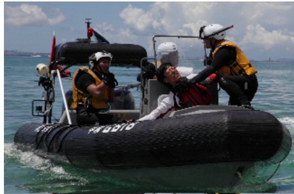
Henoko: Protesting Canoeist seized by Coastguard

On July 1, 2014, the ODB started the construction phase of the Henoko plan on Camp Schwab amid fierce protest from local citizens and municipal governments. The Japanese government had adopted heavy-handed approaches to carry out the Henoko plan. With approval from the U.S. military, the Japanese government created new “temporary restricted water areas,” expanding the previous off-limit zone of 50 meters off-shore from Camp Schwab to two kilometers, 7 mobilizing an armada of vessels under the command of the Japanese Coast Guard and beginning to drive away, or to “capture” and “release” protesters venturing towards the site in canoes and kayaks, 8 threatening them with prosecution under the infamous keitoku ho (a draconian, rarely used, “special” criminal law dating to 1952. 9 The Okinawan media reported (September 12) that “[a]cts of violence are taking place on a daily basis,” and that assault proceedings had been initiated against three of the Coast Guard officers. 10