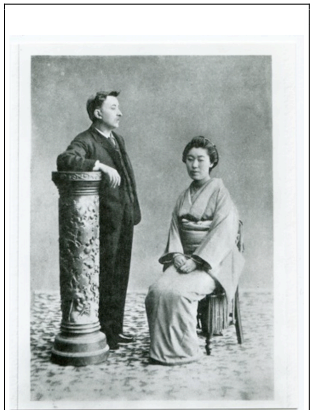
Hearn and his wife Setsu

Hearn may have been a story-reteller of great perspicacity, but his prose is rich in the florid clichés of the Victorian era and all too often bogged down by a stilted lyricism. It is fortunate for his reputation among the Japanese that this flowery language translates well into Japanese.