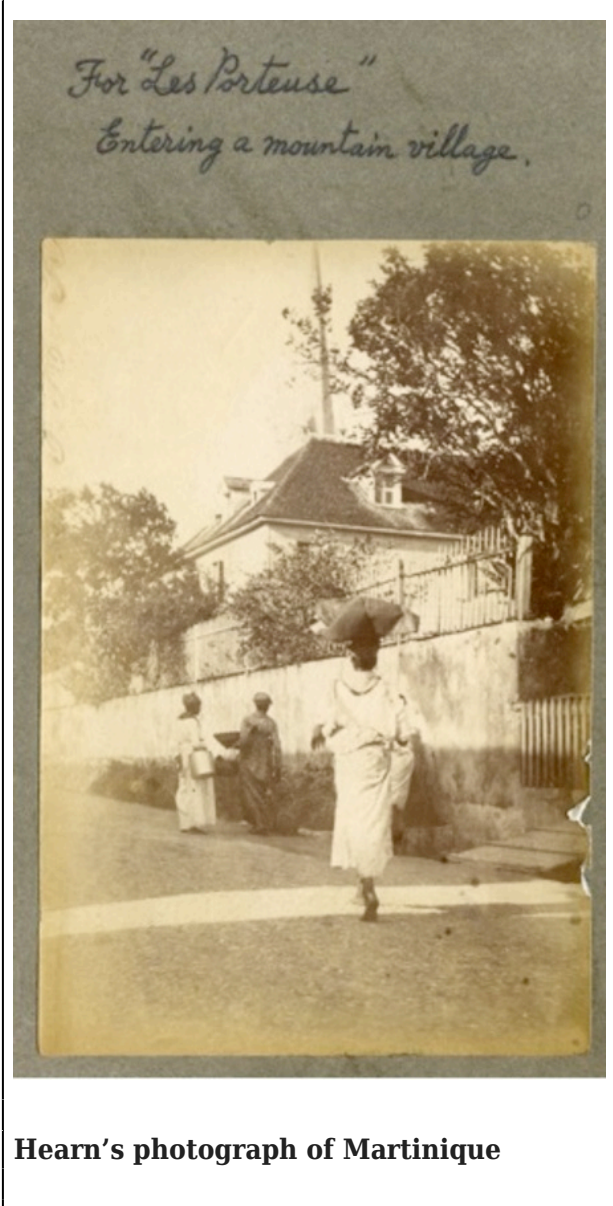
Hearn's photograph of Martinique

Had he lived another two or three decades, he would have been appalled at the manner in which the self-aggrandizing powerbrokers in the cultural establishment of Japan used him for the purposes of justifying incursions into Asia. He loathed the modern Japanese male and what he stood for, and in this he recognized the futility of his task, a futility keenly felt toward the end of his years, where he heard “nothing but soldiers and the noise of bugles.”