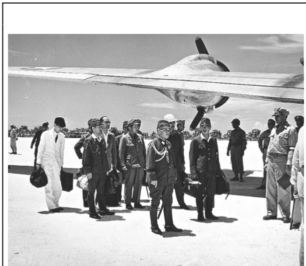
The Japanese surrender delegation on its way to the Philippines - Kawabe in centre

Eventually, it was the CIA that gained the upper hand in the struggle for intelligence control. Immediately after MacArthur's dismissal in April 1951, Willoughby too returned to the United States in a state of "nervous slump", handing over to the CIA his files, many of his contacts in Japan, and his messages of concern about the need to continue protecting and nurturing the former senior Imperial Army officers whom he considered "essential for rearmament". 30