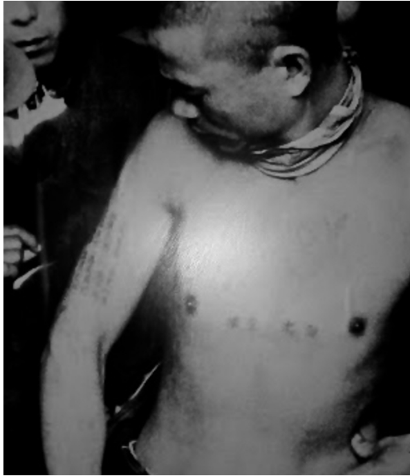
Chinese POW tattooed by his captors

being offered was participation in spying missions in North Korea and China, where the chances of capture and death were extremely high. 28