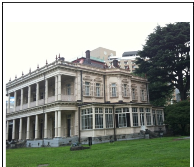
Iwasaki mansion garden