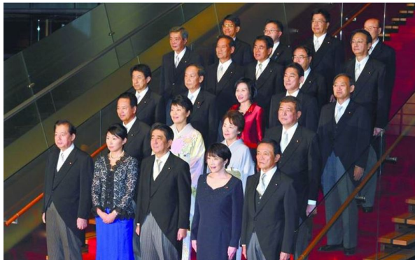
Womenomics in Japan: Five female ministers were appointed in the recent cabinet reshuffle in September 2014, but within a month two were forced to resign. (Japan Times)

This strategy of empowering women has been dubbed “womenomics”. Abe himself started to implement “womenomics” by appointing five female ministers in his recent cabinet reshuffle on 3 rd September 2014.