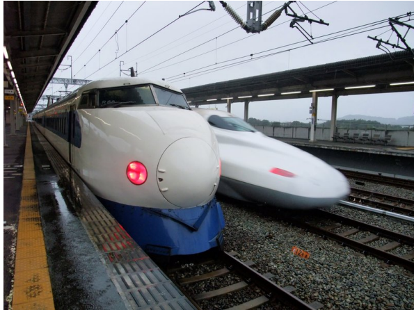
Shinkansen 0 series with Nozomi passing.