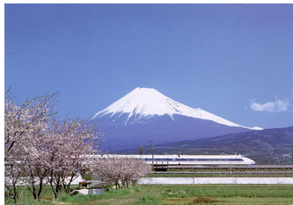
Mount Fuji with Shinkansen and cherry blossoms.

After Tōkaidō proved itself, the links were expanded both south- and north-ward. In 1972 the Sanyō line was extended from Ōsaka to Okayama and in 1975 to Hakata in northern Kyūshū. Tōhoku line to Morioka in northwestern Honshū, and Jōetsu line to Niigata on the Sea of Japan entered service in 1982 and in 1985 the lines were extended to Tōkyō's Ueno station. In 1987 deeply indebted JNR was privatized and divided into seven regional companies: Tōkaidō shinkansen now belongs to JR Central. In 1990 Japan's bubble economy began implode and although the 1990s became known as the lost decade there were no negative impacts on the shinkansen : new lines were opened, high standards of operation were maintained and technical progress continued.