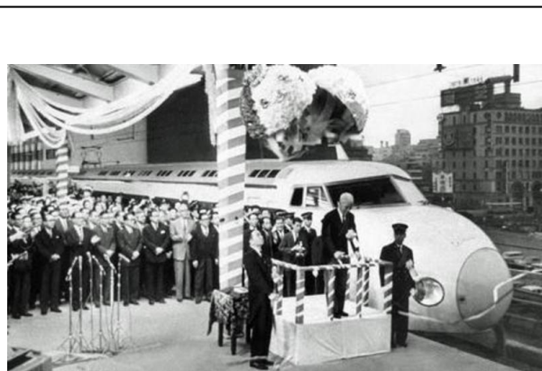
Tōkaidō shinkansen launched at Tokyo Station, 1964

route between Edo and Kyōto, the other one (new trunk line) was to distinguish the link, the country's first with standard gauge (1,435 mm) from the old narrow-gauge (1,067 mm) railways built in Japan since the first link between the capital and Yokohama in 1872. 5 As with many other megaprojects, there were some questionable cost estimates, inadequate financing and (what we know now are almost inevitable) cost overruns. In 1958 JNR put the cost at an unrealistically low ¥ 194.8 billion (equal to $ 541 billion in 1958 monies and to at least $4.5 billion in 2014 $) in order to secure the government's funding approval, and the World Bank's eventual loan of just $ 80 million was only about 15% of that grossly underestimated budget. The actual cost reached ¥ 380 billion (just 5% short of doubling the original estimate) and even before the project was completed these large overruns led Sogo Shinji, the President of JNR, and Shima Hideo, the company's VP for engineering, to resign in 1963. But the project was finished on time on October 1, 1964, that is just in time for the Tōkyō Olympics, after five years and five months of construction.