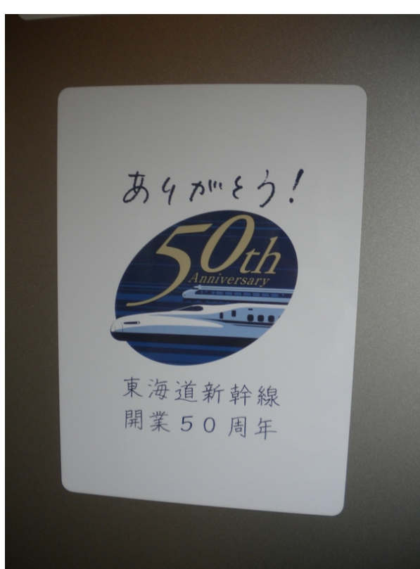
Modest 50 th anniversary: small stickers in shinkansen cars in 2014.

We take for granted that governments should be involved in taking care of security and improving the conditions for economic development. Both of these goals require adequate investment in basic infrastructures that will provide decades-long benefits: in North America there is little argument that highways belong to this category: just consider the continuing economic, social and security benefits of the U.S. interstate system launched under Eisenhower and built with federal financing. This does not mean that there should be an indiscriminate preference for rapid trains. After all, it must be acknowledged that Japan has the uncommon advantage of concentrated population (with daily passenger density per km of rail route almost six times higher than it is in France, and in the region served by Tōkaidō shinkansen about five times the Japanese national mean) that makes it