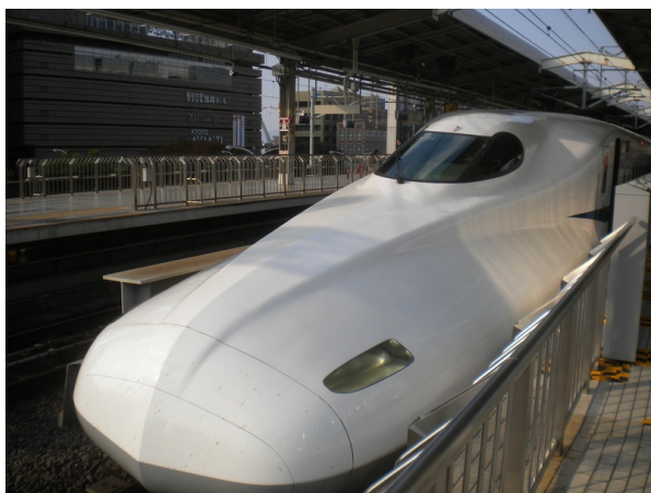
Nozomi 700 Series in November 2014.

These safety measures have made it possible to raise routine operating speeds and to cut travel times. The first trains traveling from Tōkyō at no more than 210 km/h took four hour to reach Ōsaka; just a year later the trip was down to three hours and ten minutes, and in 1992 new Nozomi trains (travelling at the maximum of 270 km/h) reduced the travel time between the capital and Ōsaka to just two hours and 30 minutes; a further 5 minutes was shaved by the latest Nozomi version (N700). But these times do not reflect maximum possible speeds, because the fastest trains must reduce speed in many sections in order to minimize noise where the line transects inhabited areas.