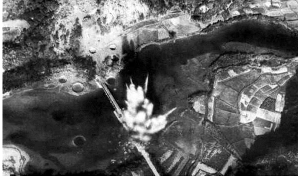
US bombing during the battle

As the carnage continued, in the Headquarters cave at Mabuni on 18 June Ushijima issued his last order, "The battlefield is now in such chaos that all communications have ceased. It is impossible for me to command you. Every man in these fortifications will follow his superior officer's orders and fight to the end for the sake of the motherland. This is my final order. Farewell." To this, his chief of staff, Lt. Gen. Cho added: "Do not suffer the shame of being taken prisoner. You will live for eternity." 51 After urging their troops to "fight to the end," within four days, both the commanders of the 32nd Army, Ushijima and Cho, had taken their own lives, thereby removing the opportunity for the remaining Japanese troops to carry out an organized surrender which would have helped to avoid the final "mopping-up" operations that claimed so many civilian victims. 52