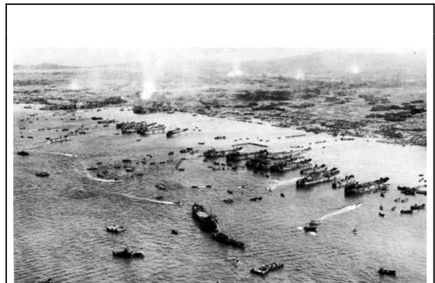
US Marine landing April 1, 1945 (Aerial view)

Early in the morning of 1 April 1945, a fleet of 1,300 vessels landed US forces on the beaches at Chatan and Yomitan either side of the mouth of the Hija River on the west side of central Okinawa. It was the start of fierce fighting that would last three months.