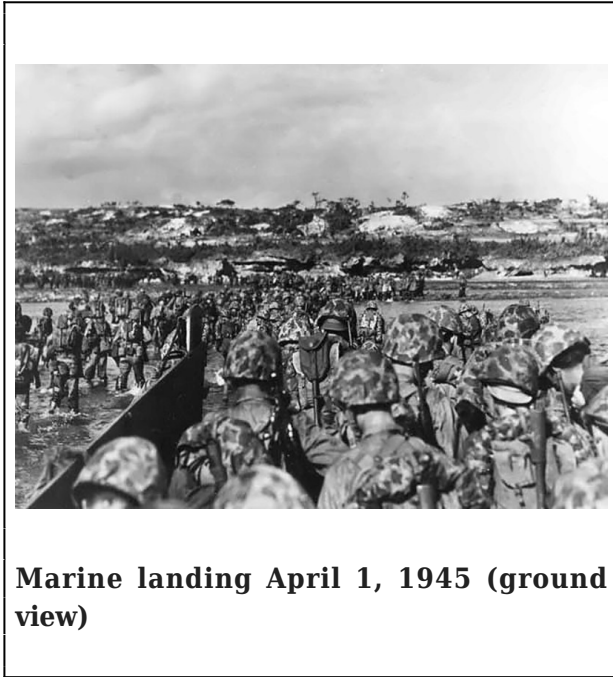
Marine landing April 1, 1945 (ground view)