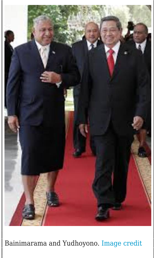
Bainimarama and Yudhoyono.

This open diplomatic confrontation was evidence that Indonesia's diplomatic offensive over West Papua was well underway. Despite the heartfelt support for the West Papuan struggle within the Vanuatu government and the country as a whole, this sentiment is much weaker in the other Melanesian countries. Their support for the cause has waned as their financial and strategic relationship with Indonesia has blossomed, and it is hard to separate these two developments. The financial and strategic support from Indonesia can be clearly linked to the withdrawal of support by the MSG states for West Papua. The clearest example of this has been Fiji.