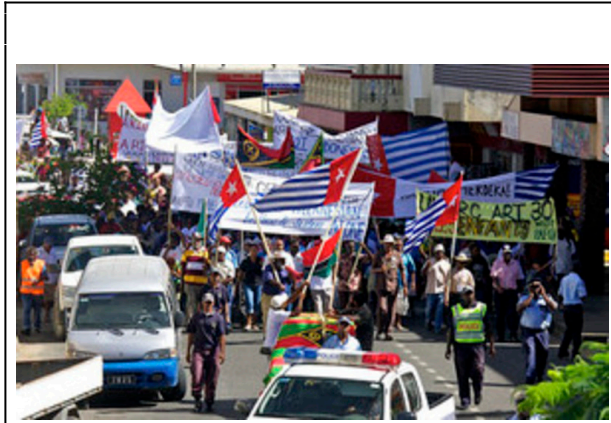
Rally for West Papuan independence in Port Vila, Vanuatu, March 5 2010. Image credit: Asia-pacific-action.org. Original image location

leaders are fearful of losing MSG support for their cause as the West Papua issue promises to be an ongoing and possibly explosive one for the organisation.