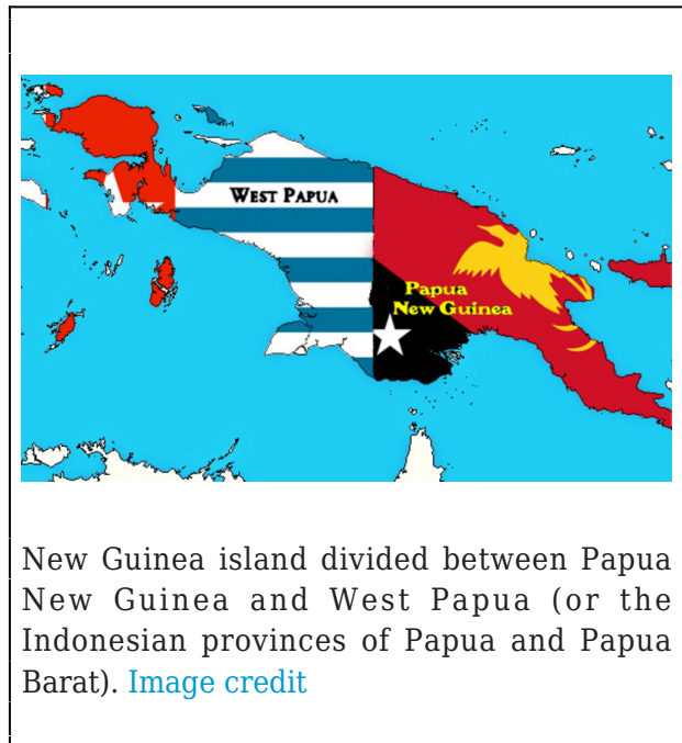
New Guinea island divided between Papua New Guinea and West Papua (or the Indonesian provinces of Papua and Papua Barat).

spokesperson for Fijian opposition party the United Front for a Democratic Fiji has accused Indonesia of meddling in Fijian internal affairs by offering support for Fijian Prime Minister Commodore Bainimarama in anticipation of his re-election that occurred in September 2014, and buying off support for West Papuan self-determination 65 .