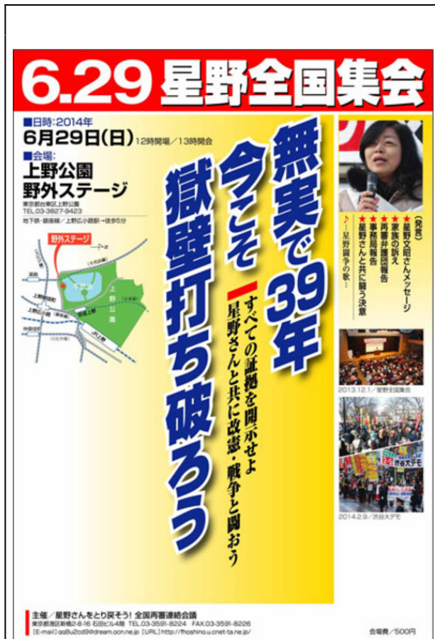
Poster for forthcoming June 29 demonstration to free Hoshino

The story of Heisei Japan is not only the economic basket case one, as the western media might have us believe; it is also one of a rising civil society, with increased numbers of volunteers and civic groups. Jeff Kingston memorably calls this "Japan's quiet transformation" and it is perhaps typified by the nation's three-fold increase in volunteers between the 1980's and the turn of the century. Over a million volunteers assisted in the recovery operation for the 1995 Kobe earthquake and the large numbers of volunteers who helped after the Tōhoku disaster showed how established the mindset has become. Carl Cassegård also recently