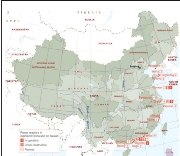
Mainland China in 2010 had 16 nuclear power reactors in operation, 7 under construction, and 34 planned. China’s existing and planned nuclear power sites (IAEA map based on July 2010 data.)

Prior to Fukushima, China had been pursuing the world’s most ambitious nuclear power program. Following Fukushima, this is still the case. Its nuclear expansion goals are primarily driven by closely related energy security and carbon emission concerns and, relative to its other power generating options, the fact that it is arguably a relatively environmentally friendly and efficient source of electricity. 2 This underscores the significance of China’s decision to forge ahead with its 12th Five Year Plan target to install 40 additional gigawatts of nuclear capacity by 2015.