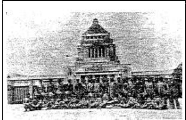
Fig.4 Taiwanese aboriginal tourists and their police minders posing for a commemorative photograph in front of the Imperial Diet, 1940. Riban no tomo , no.102 (June, 1940), 6.

By 1937, the year in which the comprehensive empire-wide campaign to make loyal subjects of colonial populations was officially launched under the name kōminka , reports of metropolitan tours in the Savage Pacifier's Companion had turned into a boilerplate litany of imperial pilgrimages, the tour organizers reporting how well behaved their charges were, and how they shed tears and sang the anthem at the sight of the Double Bridge, while some of the tourists themselves were quoted reporting (in post-tour gatherings held at police stations back in Taiwan) their awe, gratitude and pride at being taken to the sacred metropole. Ironically, the only exception mentioned in the journal was a representative of the lowland-and therefore more "civilized"-Ami people who had had six years of formal education. Interviewed by a colonial official upon returning to Taipei, the Ami tourist answered laconically that he had been most impressed by farms, trains, the Yawata Iron Works, and the quality of metropolitan rice. He made no mention of either imperial monuments or emotions of reverence and awe. 22 The deep involvement of colonial police in everyday life in the highlands, together with the metropolitan effort to overawe the more recalcitrant peoples, may finally have succeeded in creating a stronger bond between some of them and the emperor state than did the attempts at assimilation among aborigines who had not taken up arms against the colonizers.