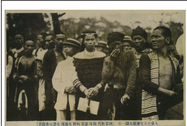
Figure 1: postcard of Taiwanese aborigines representing several tribes arriving in Tokyo, 1910s.

Despite this contrast to what we would ordinarily call a tourist trip, the tours were referred to at the time as kankō 観光, using the term that today is the standard equivalent of the English "tourism." Kankō , however, was not in common parlance in Japan in 1897, when it first appears in the colonial archive with reference to the naichi kankō (metropolitan tour) of a Taiwanese group. Neither the dictionary Nihon shinjirin (Sanseidō, 1897) nor the dictionary Kotoba no izumi (Ōkura shoten, 1898) has an entry for kankō . The Sanseidō New English-Japanese Dictionary of 1902 offers other Sino-Japanese words rather than the modern kankōkyaku as translations for "tourist." Just a few years later, however, in 1909, Sanseidō's English-Japanese Dictionary included kankō as a translation for "sightseeing." It thus appears that kankō was just coming into use at this time.