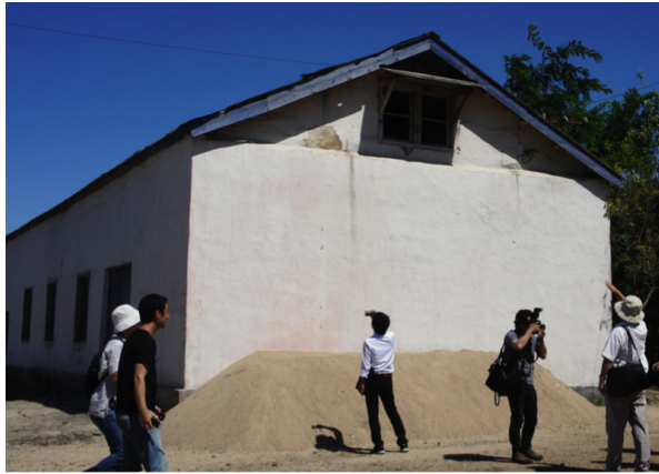
5. An agricultural storage facility located in Panghyŏn that served as a concentration facility for Japanese refugees from Manchuria.

This was a small town located along a train line. Refugees from Manchuria, mainly women and children, were dropped off here and concentrated in schools, agriculture storehouses, and other such buildings. During the harsh winter they sought both food and protection against the cold in shared housing with Koreans. Dysentery and other epidemics claimed the lives of 157 people, ninety percent of whom were children. Their final resting place was a common grave that sits on the southern slope of a mountain. A 78-year old male resident offered: "Every resident of Panghyŏn accepted a Japanese refugee into their home. We lived together. When a Japanese died a member of the regional People's Committee buried the person. I was a student in the public school at the time, and I didn't know where they buried these people. Around 1983, when I built my house, their remains surfaced. This area apparently was a common burial ground for Koreans from long ago and up until 1950 it was filled with graves. But they have since been relocated. Director Cho Hŭisŭng, who has conducted investigations in the area, added: "Military swords excavated in the area confirm the site to have been a