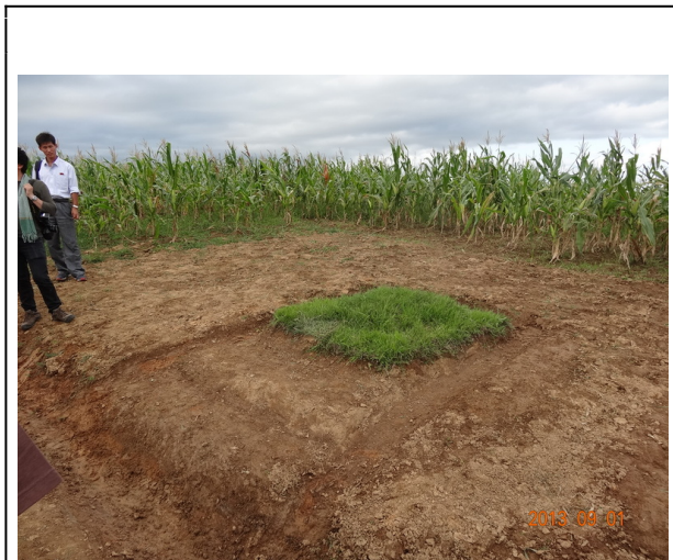
4. Pup'yǒng burial site where remains surfaced in a cornfield.