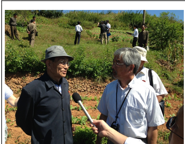
1. Author (right) listening to residents' accounts at the Panghyŏn site.

lacked the capacity to determine whether they belonged to dead Japanese or Koreans. Our purpose was simply to survey the burial sites and the surrounding areas to uncover stories that led to the location serving as the people's final resting place. These burial sites consisted of two different types: the formally established cemetery plots and the less formal randomly selected burial areas.