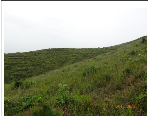
2. Ryongsan Cemetery in the western suburbs of P'yöngyang. The front side has Japanese graves, the other side of the mountain is reserved for Korean graves.

三合里 Samhamri (eastern suburbs of P'yöngyang)