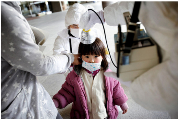
US doctor examines a young Rongelapese affected by Bravo radiation