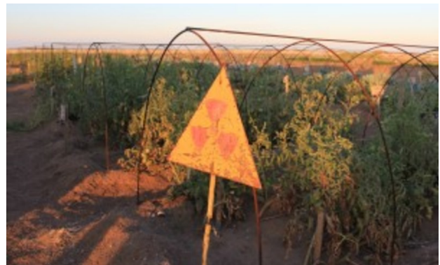
"Temporary housing" for those evacuated from Bikini Atoll (left) and Fukushima (center)