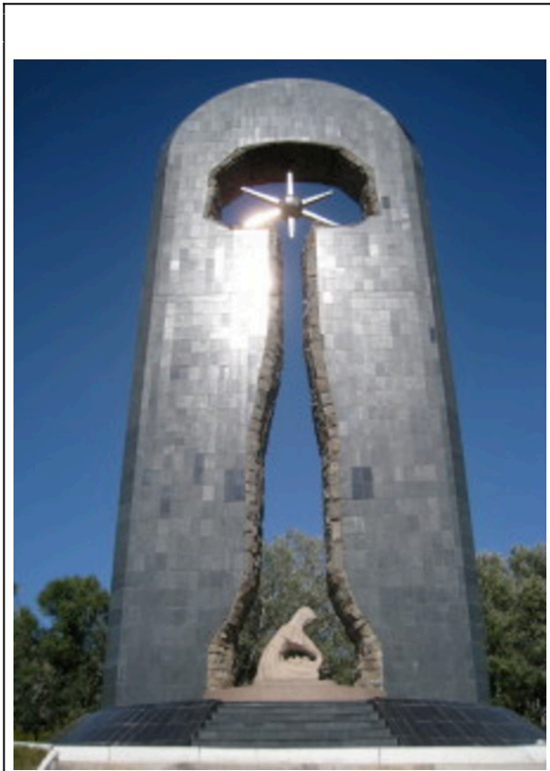
The memorial "Stronger than Death" in Semey, Kazakhstan

Conclusion -Radiation makes people invisible. It makes them second class citizens who no longer have the expectation of being treated with dignity by their government, by those overseeing nuclear facilities near them, by the military and nuclear industry engaged in practices that expose people to radiation, and often by their new neighbors when they become refugees. People exposed to radiation often lose their homes, at times permanently, either through forced removal or through contamination that makes living in them dangerous. They lose their livelihoods, their diets, their communities, and their traditions. They can lose the knowledge base that connects them to their land and insures their wellbeing.