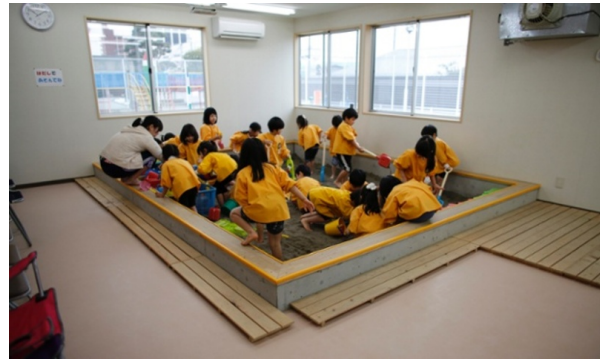
Fukushima school children play in an indoor sandbox

In Fukushima Prefecture the Japanese government proclaimed a 20km mandatory evacuation zone, while also designating a "suggested" evacuation zone from 20km to 30km. These zones do not directly reflect the dangers from radiation levels. In some of the mandatory evacuation areas the gamma levels are below those in parts of the suggested evacuation areas. Some areas where the plumes came down 50-80km away have even higher levels. The limits to mandatory evacuation areas reflect efforts to limit the direct liability of the government. Even today children live in areas where the radiation levels are too high for them to be allowed to play or spend significant time outdoors. 5