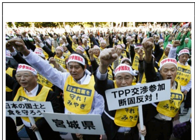
Miyagi farmers in 2011 demonstration in Tokyo: Protect Japanese agriculture

In the 21 st -century, one would expect trade negotiators to try to do better than striking down an established system, even one with serious flaws, in the absence of effective protections. The TPP, if it is to be at all acceptable, should do better than the WTO on a range of issues from environmental protection to limits on corporate abuses. Critics of WTO note that it is on record as challenging domestic laws that would bar dolphin meat in tuna products, complicate protecting sea turtles from getting killed in shrimpers' nets, and make it difficult to impose higher pollution control standards on imported gasoline. The general public, of course, if given a say, would strongly urge trade negotiators to improve such a system that came out of complex global negotiations over 20 years ago. Other controversial WTO cases have involved trade in timber logged from tropical forests and attempts to ban imports of meat from cattle treated with growth hormones. There is also one case in which a country was able to keep its domestic ban on asbestos, which an asbestos exporting country had tried to strike down. If the WTO offered at best weak environmental protection, all signs point to the TPP as watering down even these minimal restraints. [ Citizen Trade - WTO & Environment ] 5