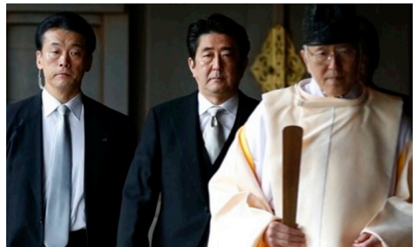
Abe (center) visiting Yasukuni Shrine

Abe's visit to the Yasukuni Shrine in December 2013 was only the climax of his career as a historical revisionist. It has been his declared objective to "overcome the postwar regime" and rectify the "distorted image" of Japan's wartime past rooted in Japanese society. The image that he is referring to, one widely shared not only by Japan's Asian neighbors but also by its patron and ally the United States, is that of Japan as an aggressor nation in the Asia-Pacific War (1931-45). For Abe, the war was rather one fought for the defense of Japan against the Western colonial powers and for the liberation of East Asia.