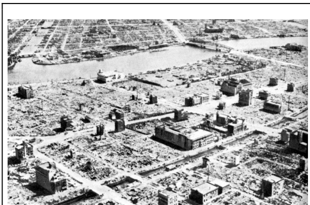
Aerial photo of Tokyo after the bombing of March 9-10.

The chief characteristic of the conflagration . . . was the presence of a fire front, an extended wall of fire moving to leeward, preceded by a mass of pre-heated, turbid, burning vapors . . . . The 28-mile-per-hour wind, measured a mile from the fire, increased to an estimated 55 miles at the perimeter, and probably more within. An extended fire swept over 15 square miles in 6 hours . . . . The area of the fire was nearly 100 percent burned; no structure or its contents escaped damage.