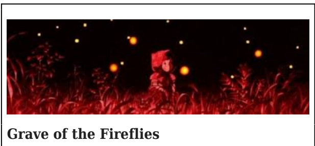
Grave of the Fireflies

Among notable exceptions to the literary and artistic silencing of the firebombing, perhaps best known in both Japan and the United States is Grave of the Fireflies (Hotaru no haka), Nosaka Akiyuki's semi-autobiographical novel made into a successful 1988 film directed by Takahata Isao and beautifully animated by Studio Ghibli. Set in Kobe, it records the terrifying bombing through the eyes of 14-year old Seita and his 4-year old sister Setsuko, who lose their mother in the flames and themselves die in poverty in the aftermath of Japan's surrender. 30 The surviving victims of firebombing doubtless recorded their experiences in diaries, poems and memoirs. Yet nearly all of these responses to the firebombing remain confined to the private sector, the individuals and families of their creators.