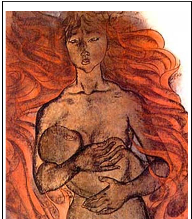
From "Fire", Second of The Hiroshima Panels by Maruki Iri and Toshi

In much of the literature and memoir, as in the film, anime, photography and painting, there is an immediacy of the human experience that transcends argument and debate and conveys powerful human emotions including deep sympathy for victims, many of them women and children. In some can also be found a sense, rarely explicitly stated, of the inhumanity of the assailant.