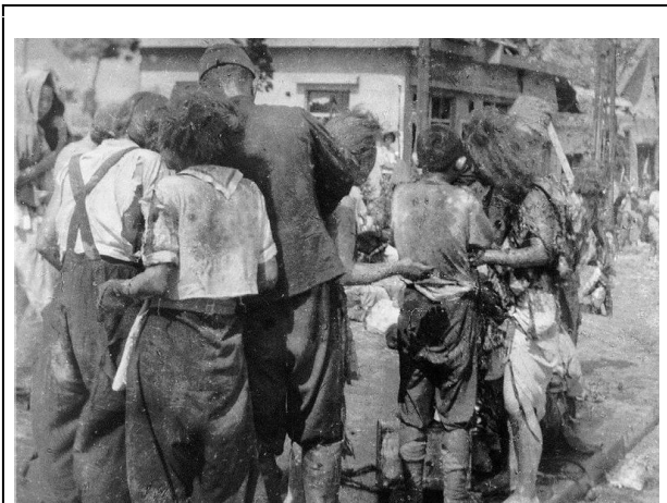
Atomic Bomb survivors at Miyuki Bridge, Hiroshima, two kilometers from Ground Zero. Aug. 6, 1945. Under US censorship,

Japan was deliberately withheld from the Japanese public by US military censors during the Allied occupation-even as they sought to teach the natives the virtues of a free press. Casualty statistics were suppressed. Film shot by Japanese cameramen in Hiroshima and Nagasaki after the bombings was confiscated. Hiroshima , the famous account written by John Hersey for The New Yorker , had a huge impact in the US, but was banned in Japan. As [John] Dower says: 'In the localities themselves, suffering was compounded not merely by the unprecedented nature of the catastrophe...but also by the fact that public struggle with this traumatic experience was not permitted .'" 25 The US occupation authorities maintained a monopoly on scientific and medical information about the effects of the atomic bomb through the work of the Atomic Bomb Casualty Commission, which treated the data gathered in studies of hibakusha as privileged information rather than making the results available for the treatment of victims or providing financial or medical support to aid victims. The US also stood by official denial of the ravages associated with radiation. 26 Finally, not only was the press tightly censored on atomic issues, but literature and the arts were also subject to rigorous control prior.