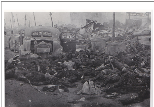
Bodies of people trapped and burned as they fled through a street during the attack on the night of March 9-10.