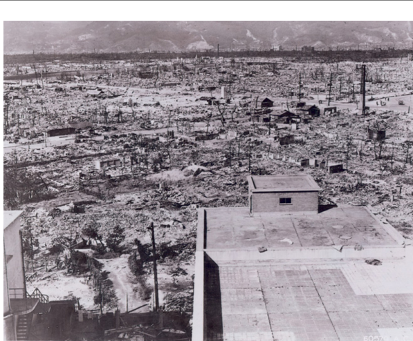
Hiroshima after the bomb.

Japanese debate over war responsibility or the nature of the imperial or imperial-military system in general, and the decision to sacrifice Okinawa and Japan's cities with massive loss of life in particular.