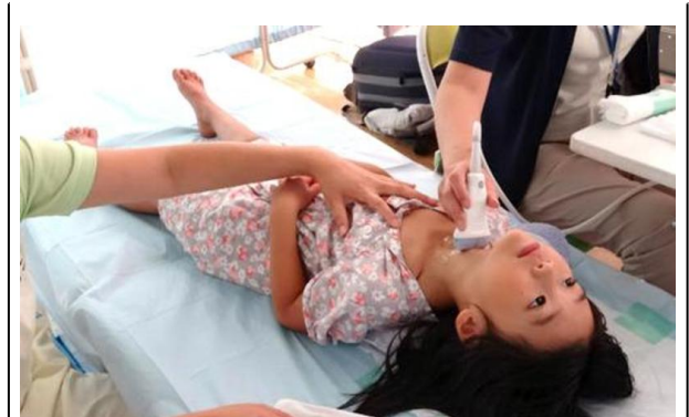
A thyroid test

On 9 October 2011, Fukushima Medical University (FMU) started a two-stage programme of thyroid cancer tests for 368,000 residents in Fukushima Prefecture who were aged 18 or under on 11 March 2011. The first stage was the 'Preliminary Baseline Survey' and began on residents in 'high exposure areas' and eventually covered all municipalities. The original plan had been to commence three years after the incident, but the testing was brought forward due to parental concerns. 1 In April 2014, FMU started the second stage 'Full Scale Survey' of 380,000 residents, now including those who were in utero on 11 March 2011. Participants are to be tested once every two years until they are 20 years old, and then every 5 years for the rest of their lives. The programme uses advanced ultrasound equipment and is unprecedented in scale. It is part of a wider Health Management Survey aimed at estimating the exposure levels and assessing the health status of all Fukushima residents, approximately 2 million people. The first case of thyroid cancer was reported on 12 September 2012 after 80,000 children had been tested. 2 Since then, the numbers have risen steadily. As of writing, 56 have been diagnosed with thyroid cancer, 1 with a benign tumour, and a further 47 are suspected of having the cancer. This brings the probable total to 103 out of 296,026 eligible residents examined. 3 Thus far, nearly all initially 'suspected' cancers have later been confirmed as malignant.