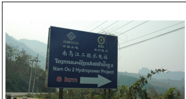
Sinohydro in Laos

Since the turn of the century, Sinohydro has become the world’s dominant dam builder. The company is engaged in an ongoing dialogue with International Rivers, having prepared a strong environmental policy framework in 2011. Yet Sinohydro is now considering building a series of highly destructive dam projects. The world’s biggest hydropower contractor is at a crossroads.