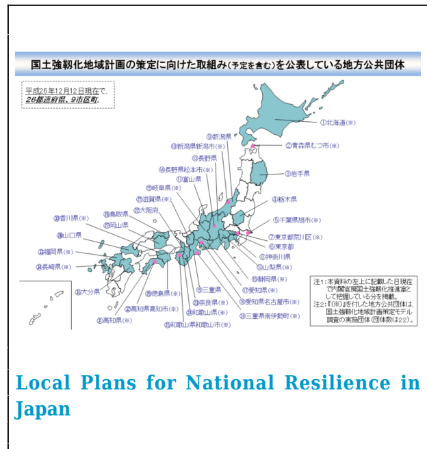
Local Plans for National Resilience in Japan

As of December 12, 2014, fully 26 prefectures and 9 cities in every region of Japan have their own resilience programmes on-line, as shown in the attached map (in Japanese). The content of these local programmes is still being worked out. Their number is likely to increase rapidly over the coming weeks, with increasing clarity in their details.