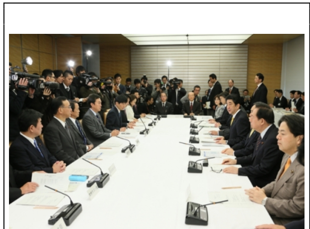
National Resilience Promotion Headquarters: Japanese Cabinet

Resilience Comprehensive Study Commission,” first mooted the idea in the Diet in April of 2012. The plan was then adopted by the party on June 1 of the same year, and submitted to the Diet on June 4 as the “National Resilience Basic Bill.” The LDP also incorporated the National Resilience plan in its campaign platform for the December 4, 2012 election.