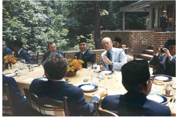
President Ford, President Suharto and his economic team.

Ford Foundation consultant Richard Bissell (who would later become special assistant to CIA Director Allen Dulles) and Chairman John McCloy conducted a series of financial transactions which enabled Ford Foundation money to be funneled into CIA organized fronts and vice versa. 24