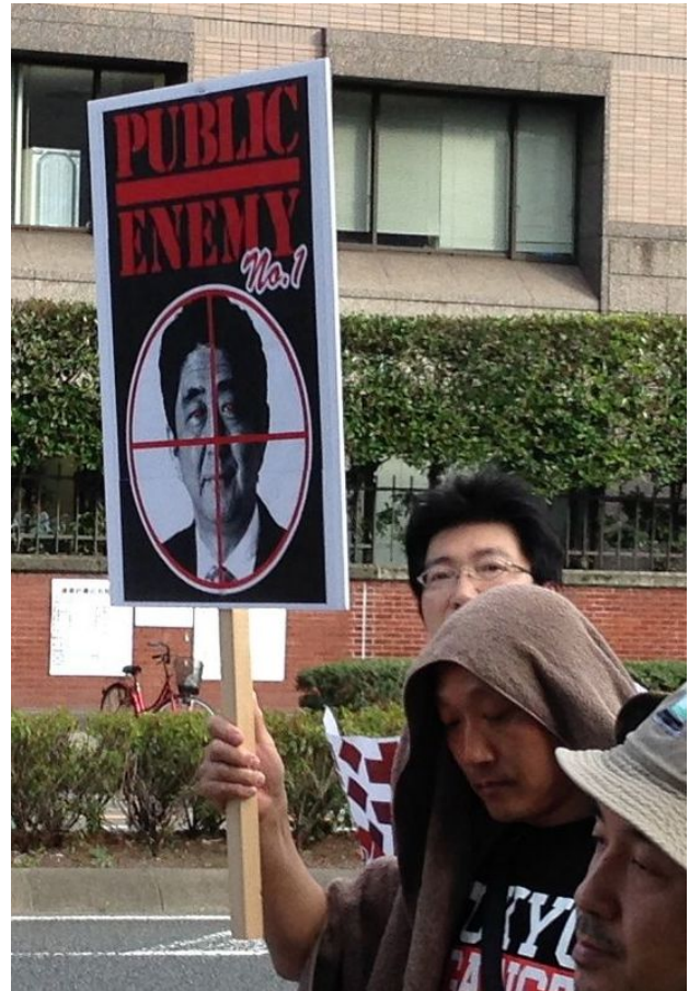
Public Enemy/TEPCO placard, Datsu Genpatsu Suginami antinuclear demonstration, February 19, 2012