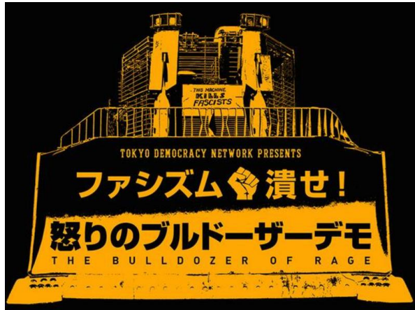
Poster, Bulldozer demonstration, Tokyo Democracy Crew