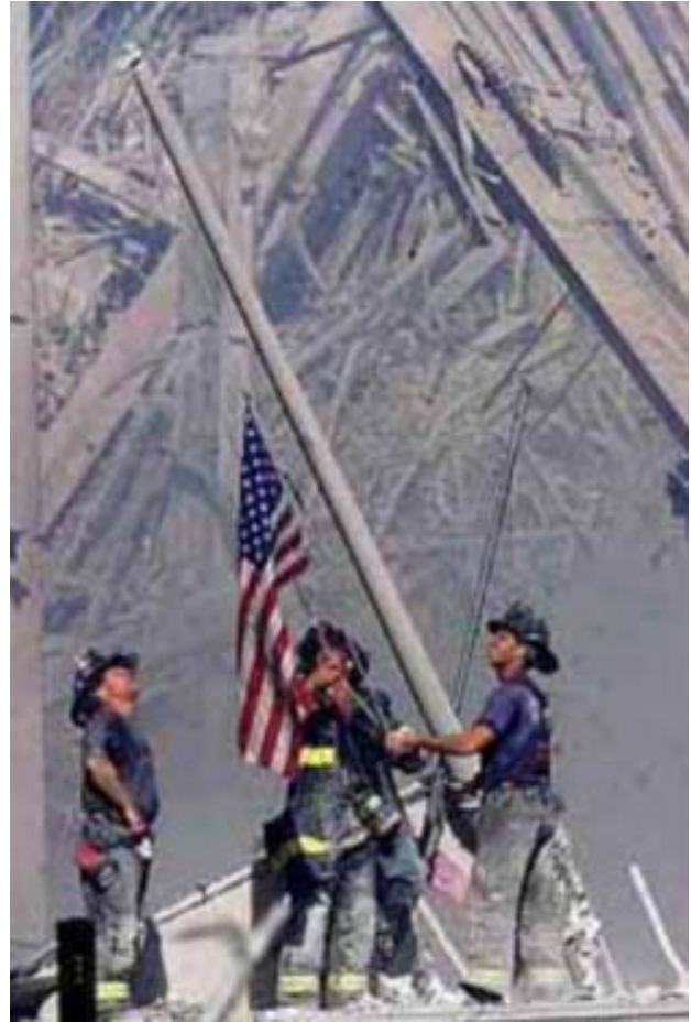
Firemen raise flag in rubble of the World Trade Center. September 11, 2001

Constructing images of patriotic citizenship, of the strong identification of ordinary people with the nation and their willingness to sacrifice themselves for its ideals, has long been the focus for national ceremonies of remembrance. In the United States, such occasions are marked on November 11, Veterans Day, and in the spring on Memorial Day—both days set aside to honor those who have fought (and died) in the nation’s wars. To these, we may add Pearl Harbor Day, December 7th and now September 11. Although not a national holiday, Pearl Harbor Day is a national day of remembrance marked with ceremonies and widespread media attention each year.