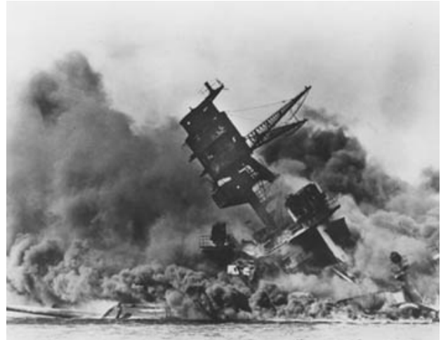
USS Arizona burns after bomb attack

Historians have long noted a certain asymmetry in American and Japanese remembrances of the Pacific War. Whereas Americans have devoted extensive resources to remembering Pearl Harbor, the atomic bombings of Hiroshima and Nagasaki remain problematic, marginal memories (Lifton 1995). In Japan, where war memories in general are more ambivalent and contested than in the U.S., the atomic bombings are, for obvious reasons, a larger focus of national interest. Whereas the official center of American memory of Pearl Harbor is centered on the national monument and shrine constructed over the sunken battleship USS Arizona, efforts to mount even a temporary exhibit of the atomic bombings at the Smithsonian Institution 1995 resulted in deep controversy and cancellation of the exhibit (Linenthal and Engelhardt 1996).