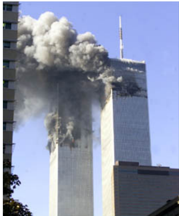
Twin Towers burn after plane attacks

American media coverage of 9-11 and the subsequent war on terror that these events have given rise to a resurgent patriotism in the U.S. not seen since World War II (In this paper I use the American name for the war, World War II). Even in Hawaii, far from the mainland United States, houses along the streets of most neighborhoods routinely display American flags; stores sell flags, pins, and banners; and cars everywhere sport bumper stickers proclaiming national pride and unity. Whether swept up in this renewed patriotism, or worried by the concomitant rise of racism and unchecked militarism, nearly everyone has been affected.