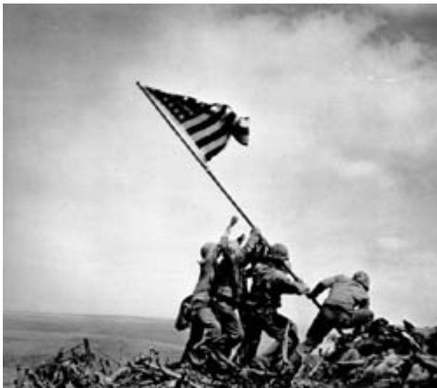
Marines raise flag during battle for Iwo Jima. February 23, 1945

entire 16-acre site to be used for a Memorial, seeing a return to commercial use as a denigration of the memory of those who died (see "Blueprint for Ground Zero," New York Times , May 4, 2002). All of the proposals reviewed initially set aside approximately seven acres of the 16-acre site as sacred ground to provide a way to incorporate some tangible reminder of the towers themselves into the memorial design. The remaining 9 acres would be rebuilt as commercial space. The design recently selected, produced by the German firm Studio Libeskind, calls for a 4.5 acre memorial park 30 feet below street level preserving the footprints of both original towers.