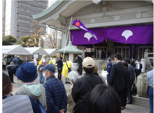
People gather outside the Tokyo Memorial Hall before a memorial service on the 78th anniversary of the Tokyo firebombing on March 10, 2023.

In their mid-eighties or early nineties at the time of filming, the central concern of the survivors was that awareness of the catastrophe and its significance may be lost for future generations if the Japanese government continues to resist honoring the victims and inscribing the event in public memory, as it has done since the early postwar years. The efforts of these three individuals, along with others, are epitomized in the film’s epigraph from Milan Kundera, “The struggle of man against power is the struggle of memory against forgetting.”