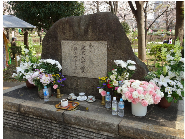
A monument for victims of the Tokyo firebombing near Kototoi Bridge, where many people died.